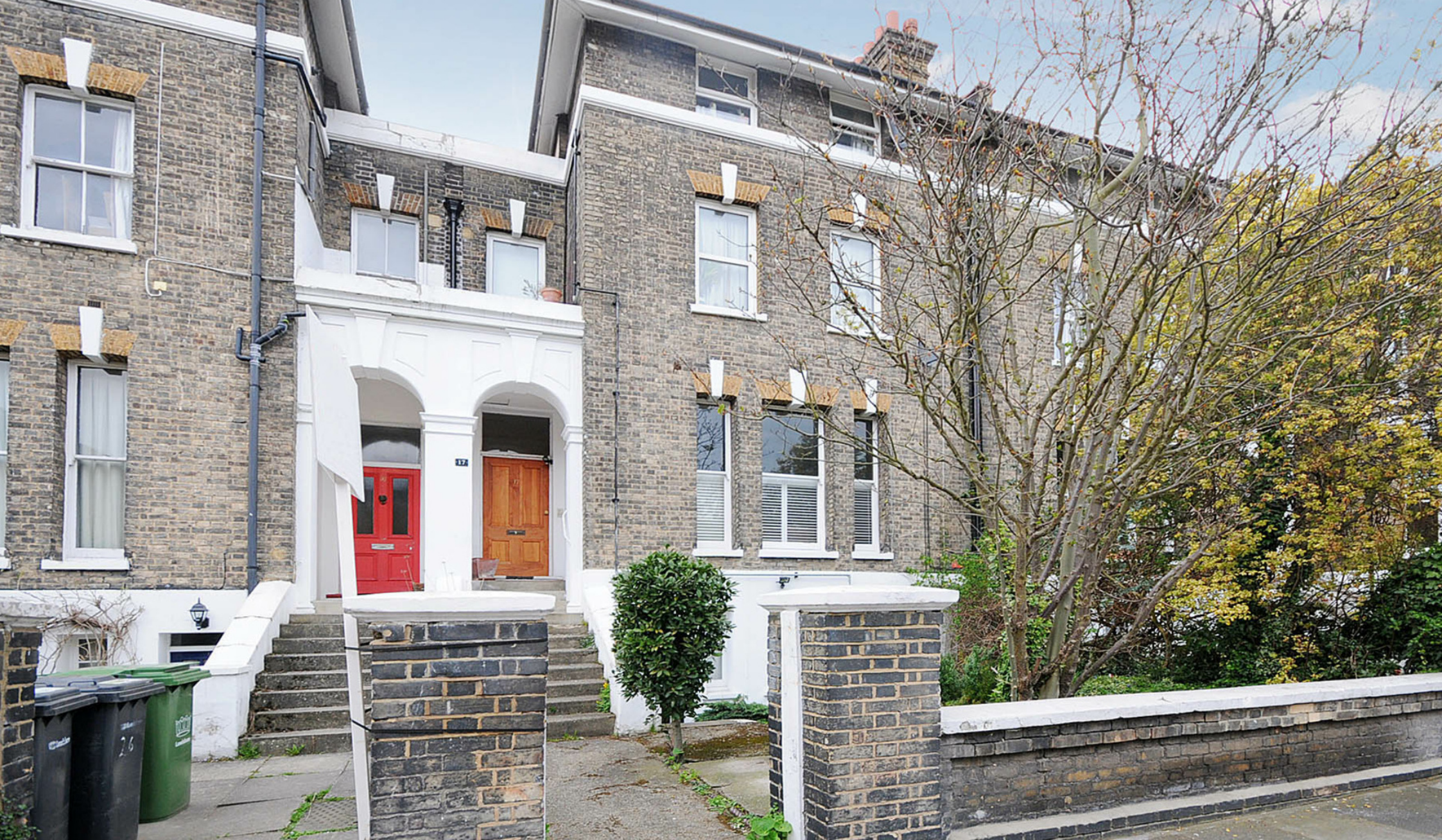
BLACKHEATH GROVE SE3 1 bedroom apartment