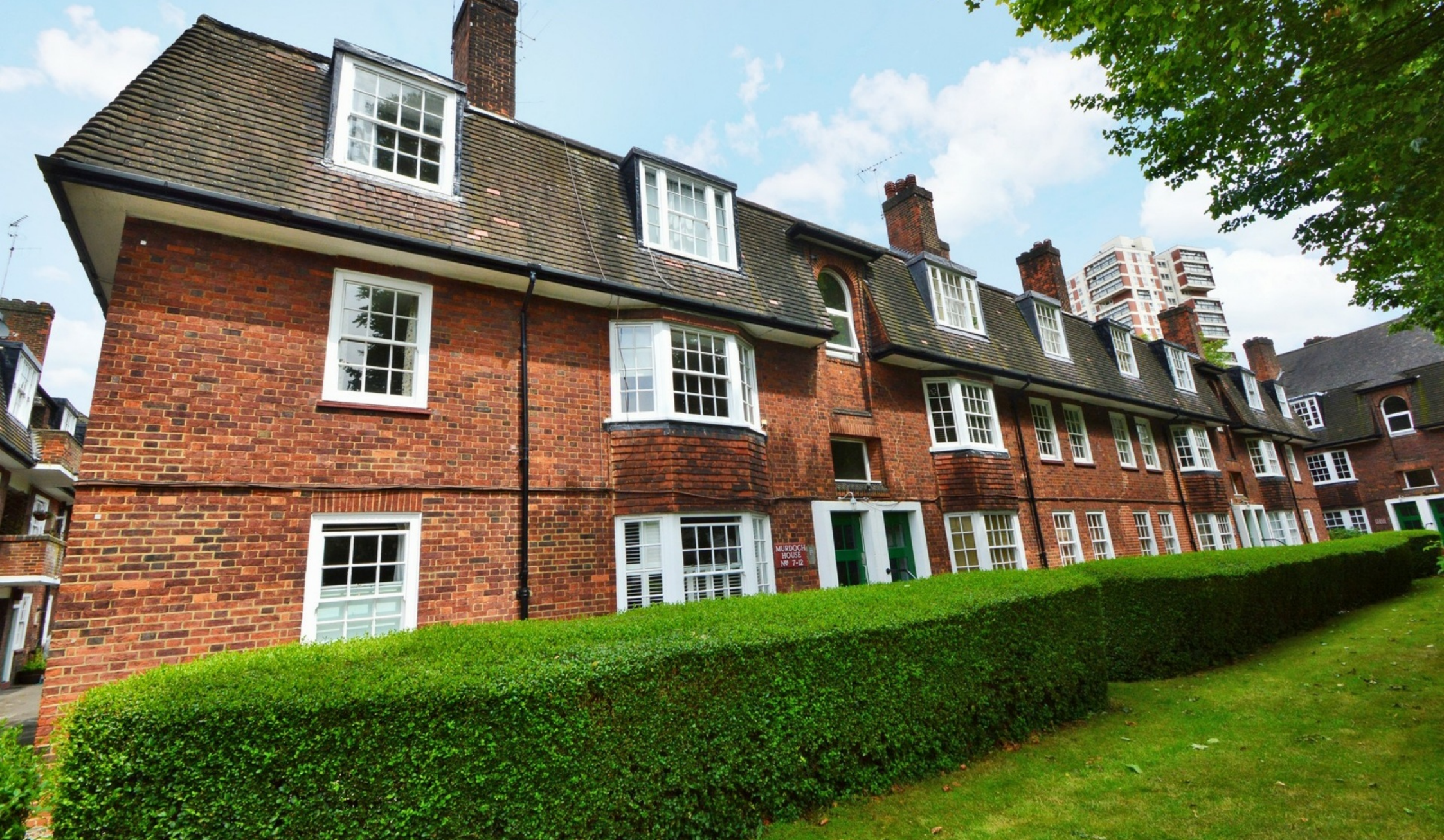
MURDOCH HOUSE SE16 2 bedroom maisonette