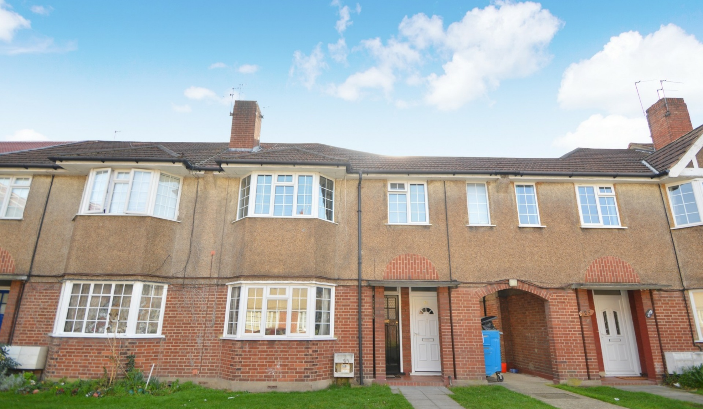
MOUNTSFIELD COURT SE13 2 bedroom apartment