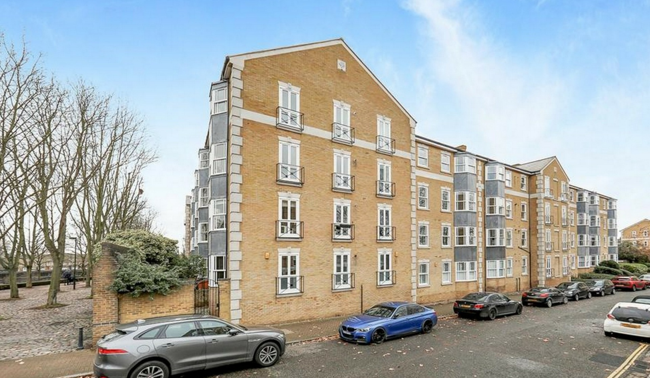
RALEIGH COURT SE16 2 bedroom apartment