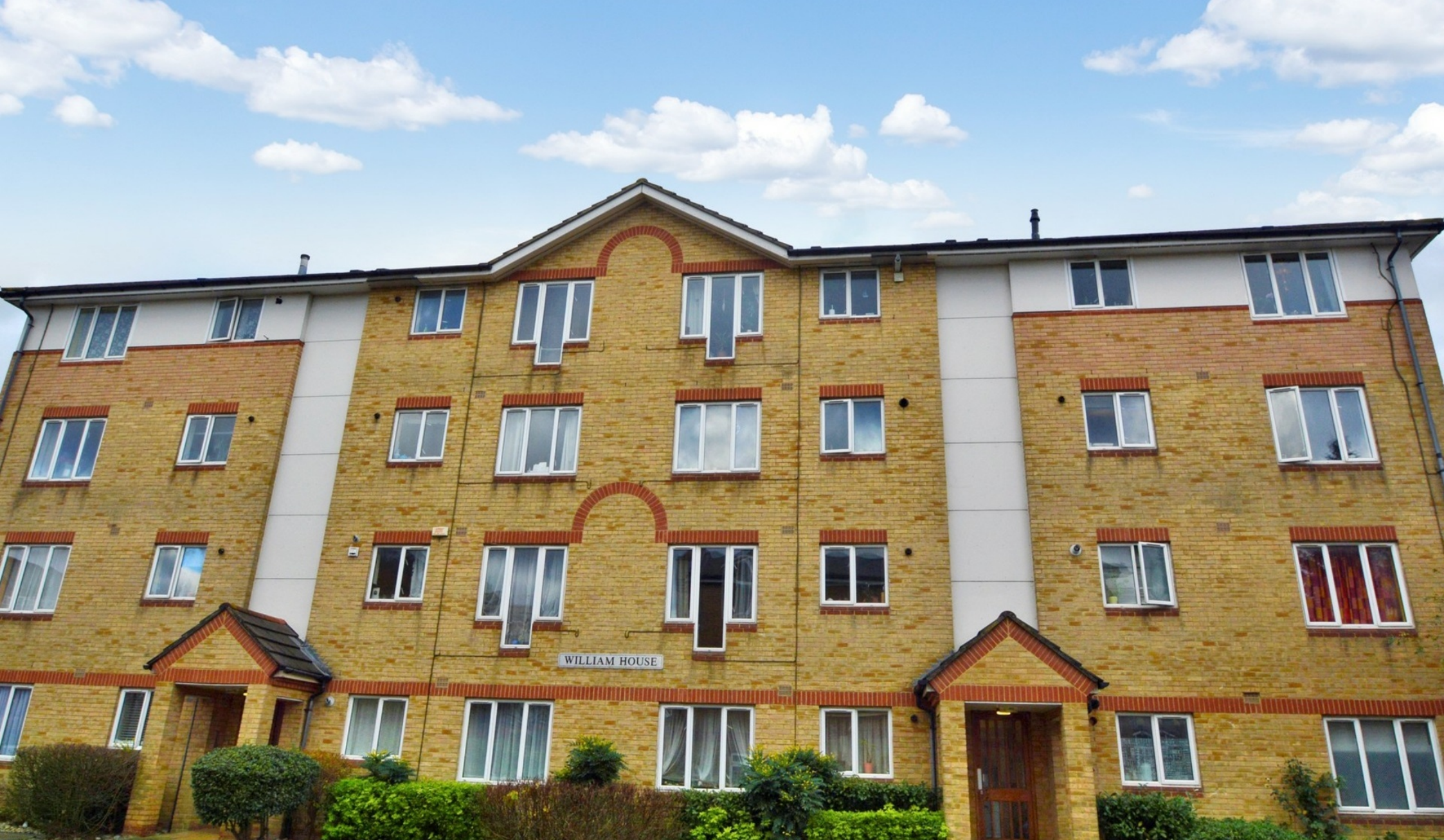
WILLIAM HOUSE SE8 2 bedroom apartment