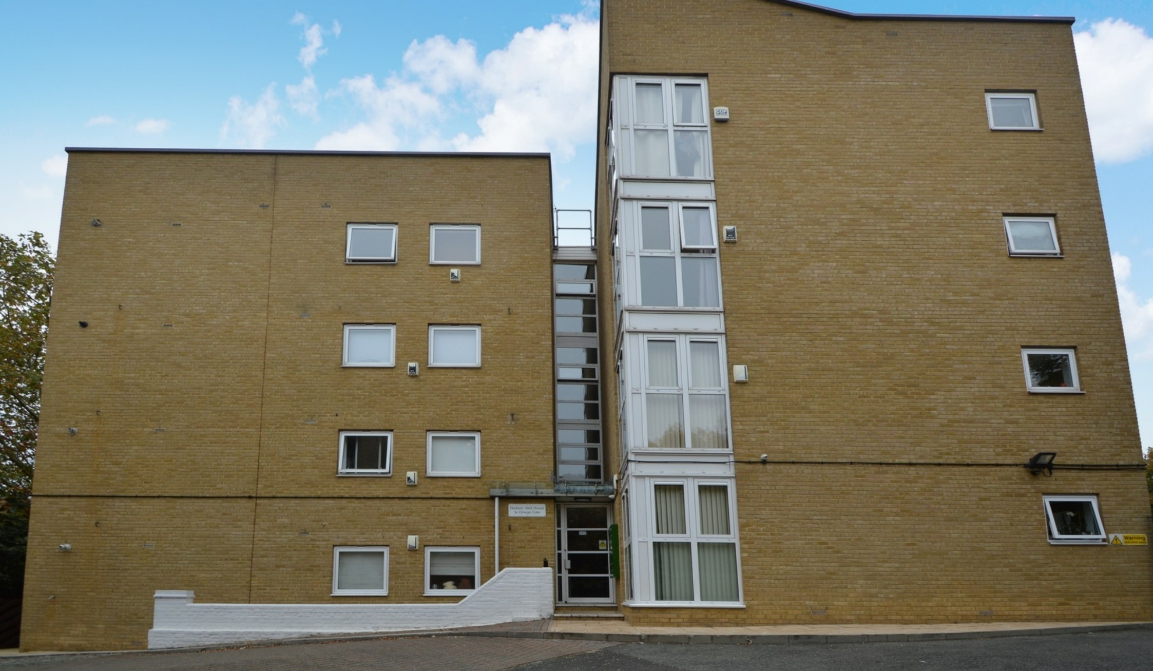
HUDSON YARD HOUSE SE16 1 bedroom apartment