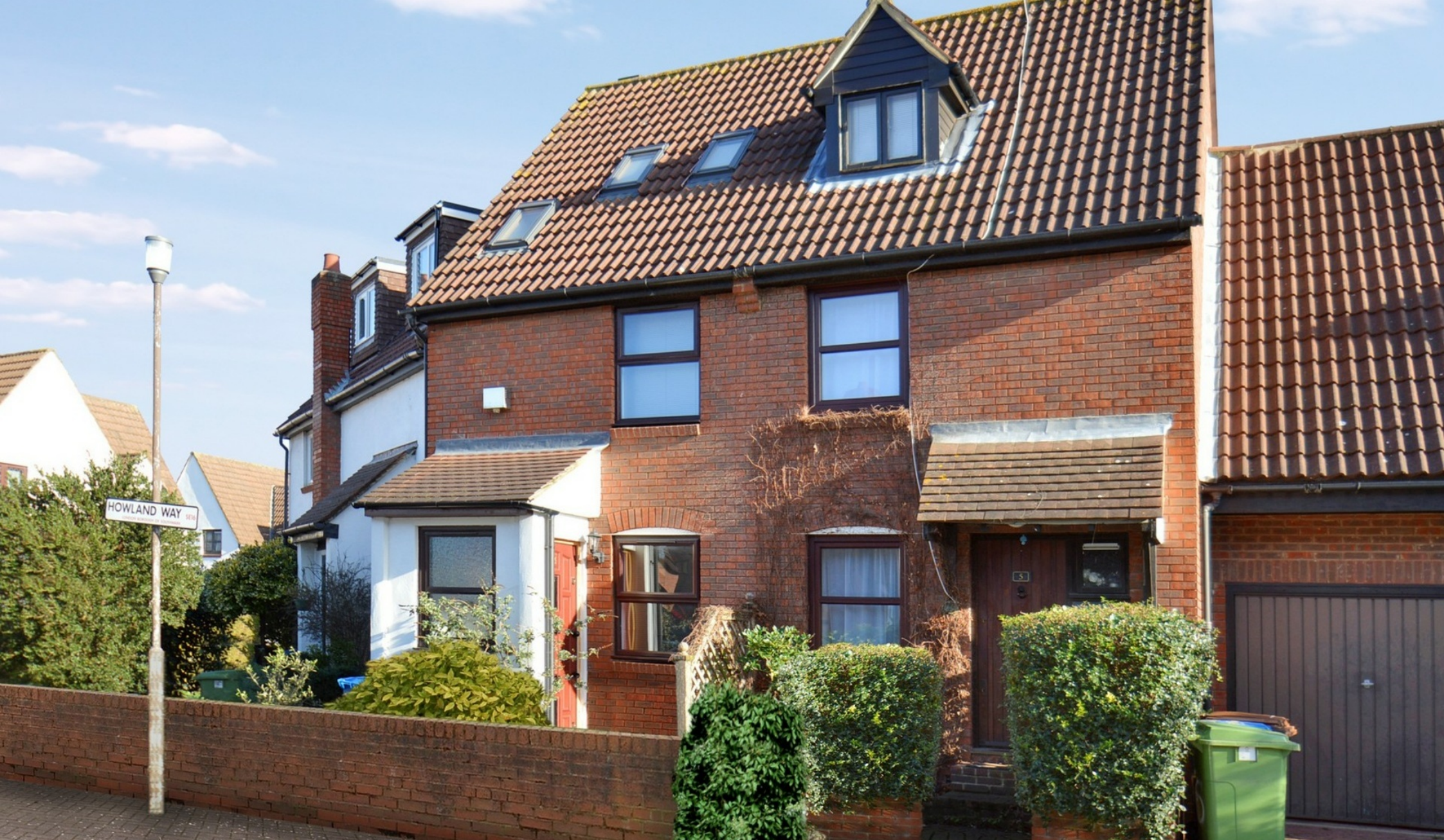
HOWLAND WAY SE16 3 bedroom town house