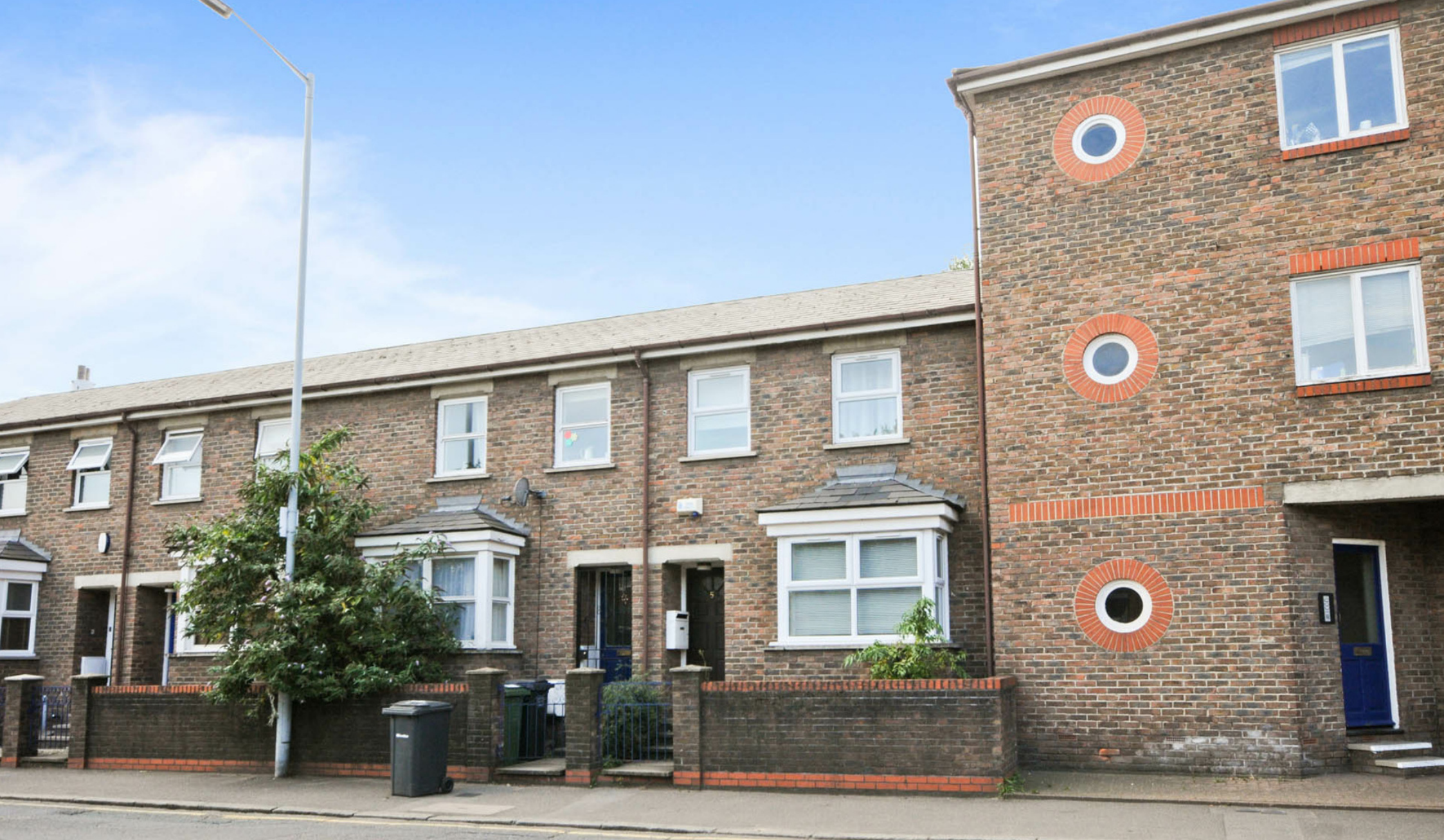
CHESTER COURT SE8 3 bedroom terraced house