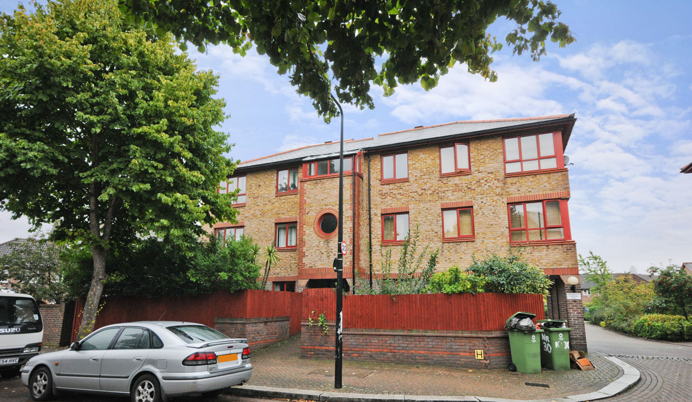
BALTIC COURT SE16 2 bedroom apartment