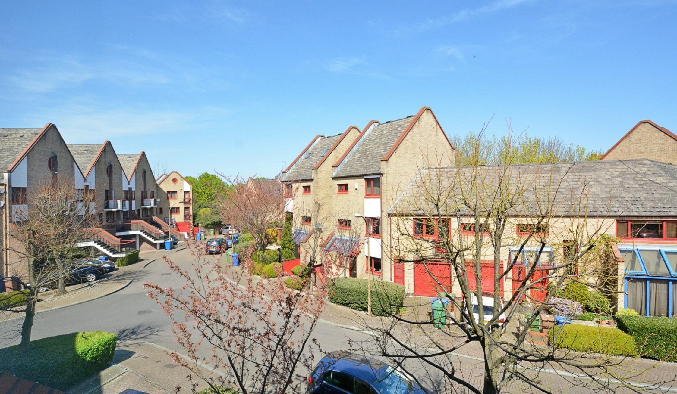
BYWATER PLACE SE16 4 bedroom terraced house