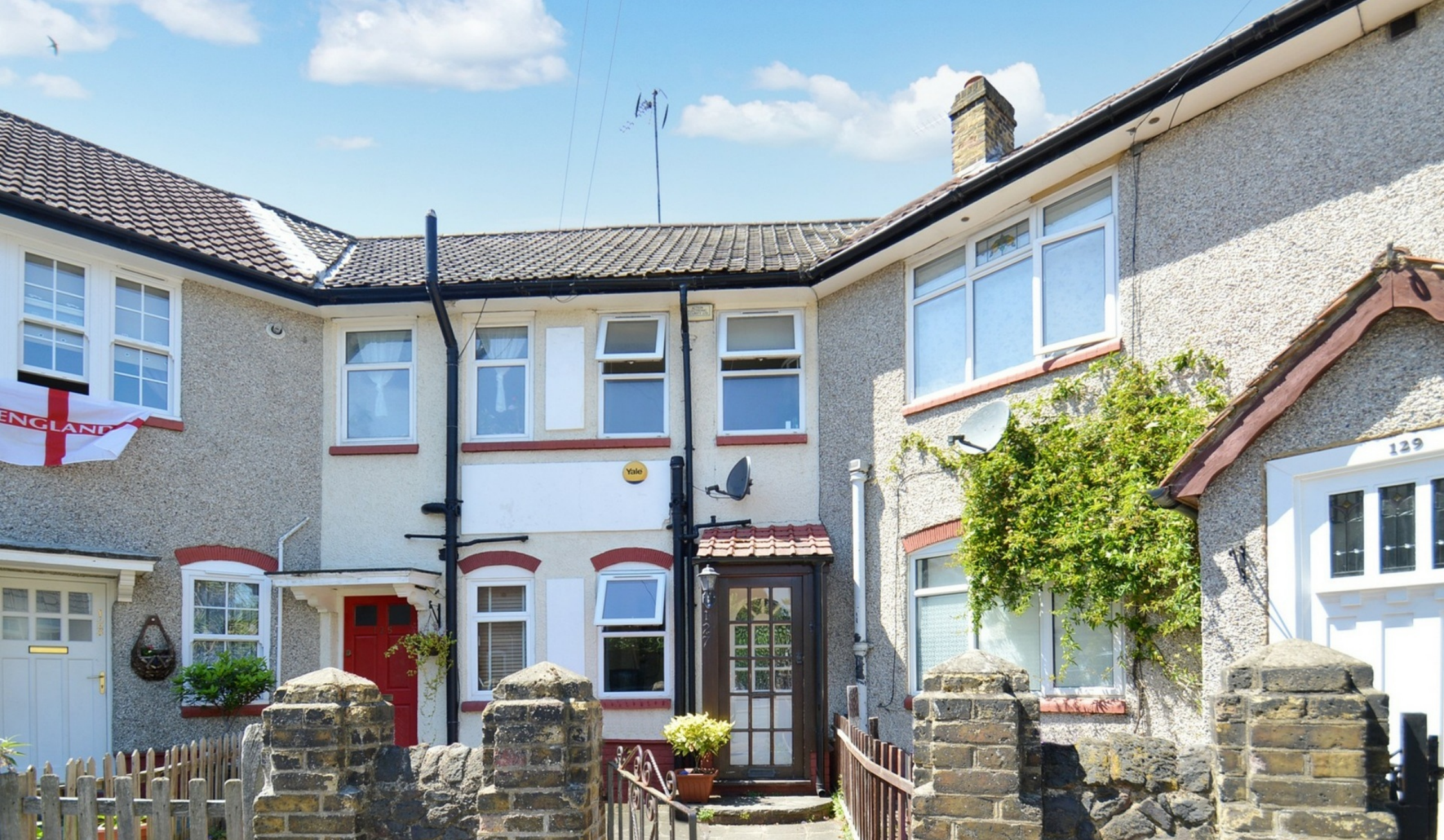
HESPERUS CRESCENT E14 2 bedroom terraced house