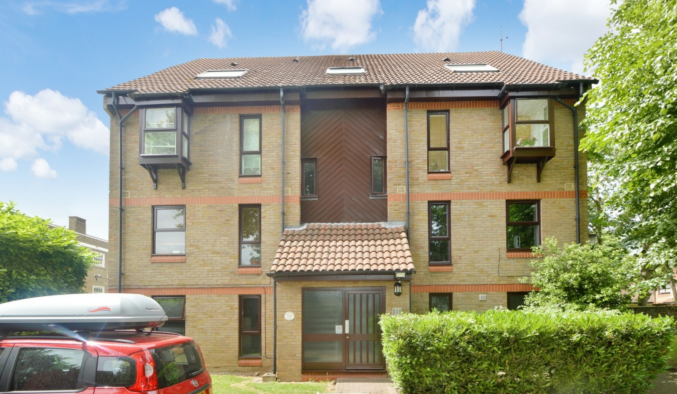
WYCHERLEY CLOSE SE3 studio apartment