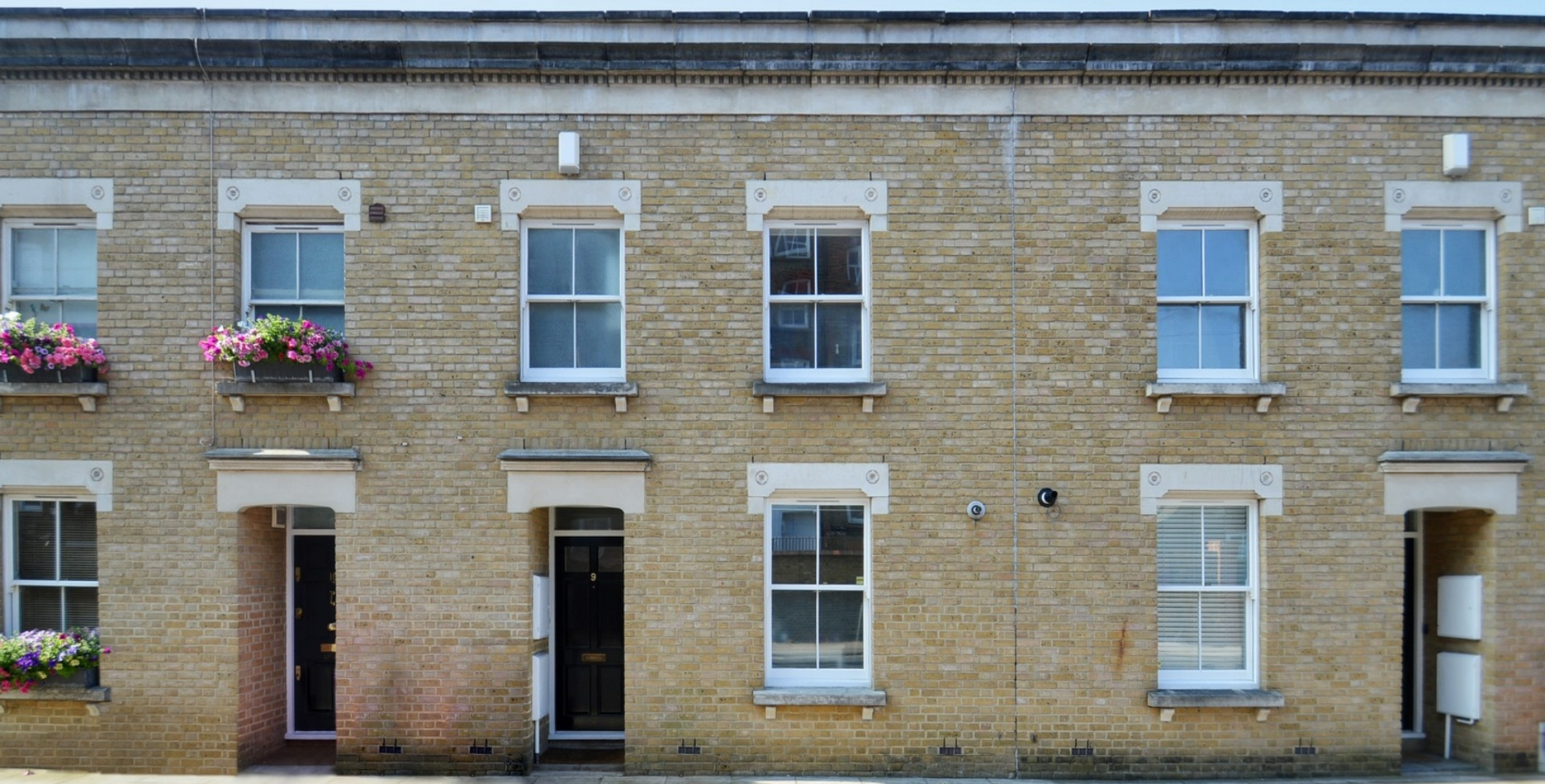
ROPERY STREET E3 2 bedroom terraced house