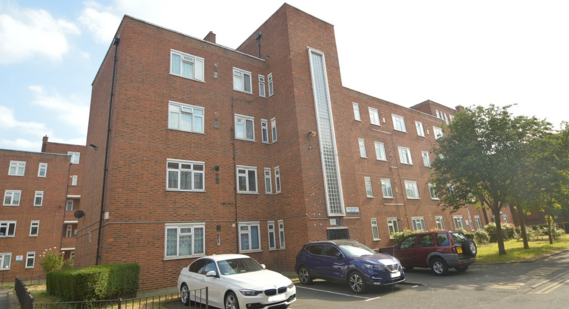
NECKINGER ESTATE SE16 1 bedroom apartment