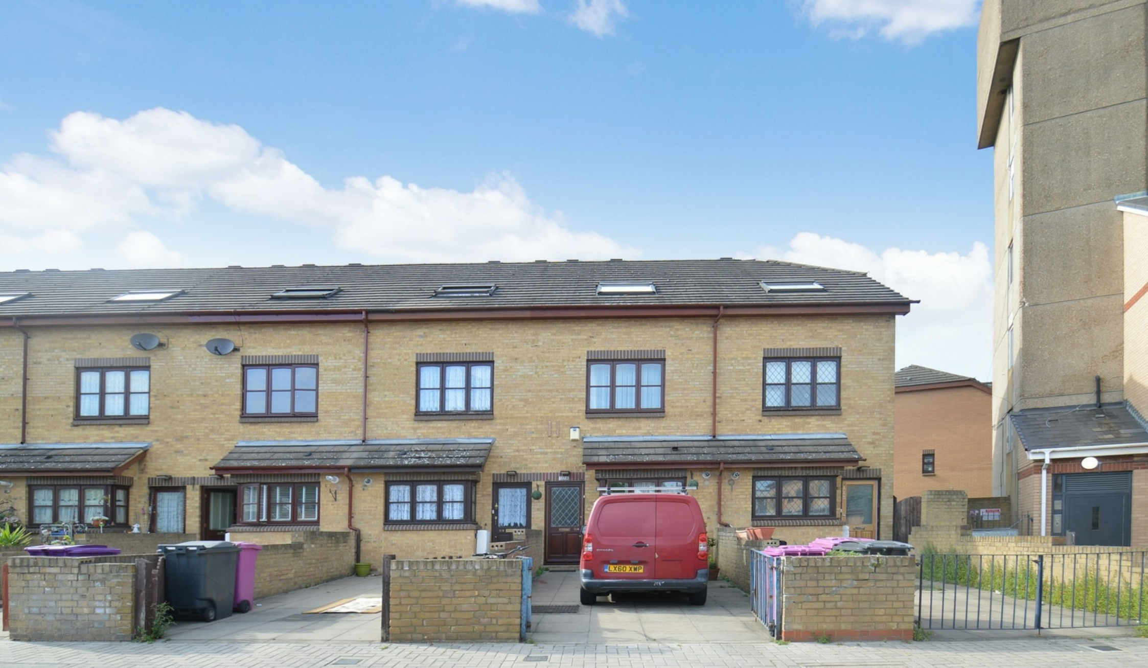
ALLEN ROAD E3 4 bedroom town house