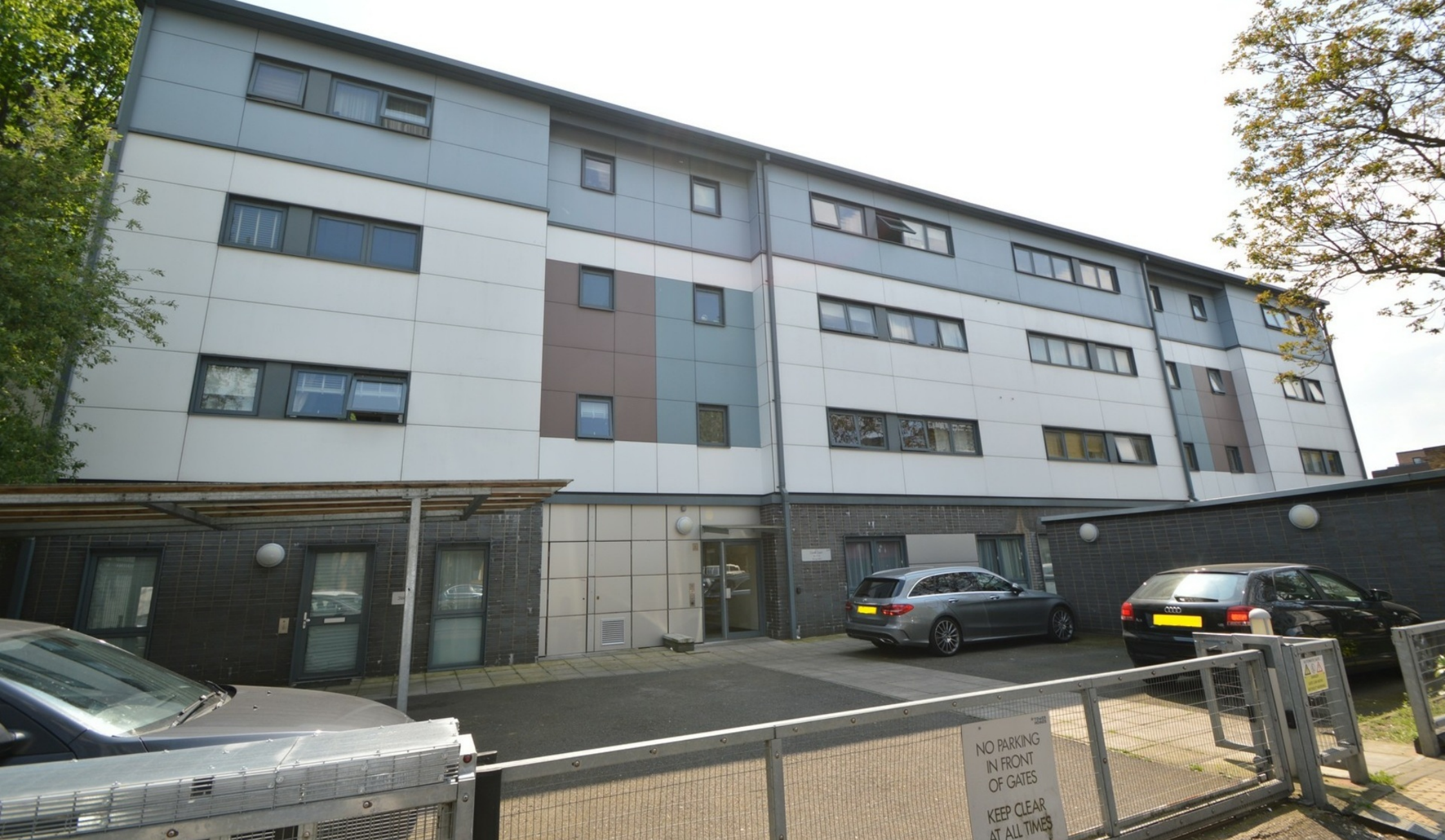
CORELLI COURT SE1 2 bedroom apartment