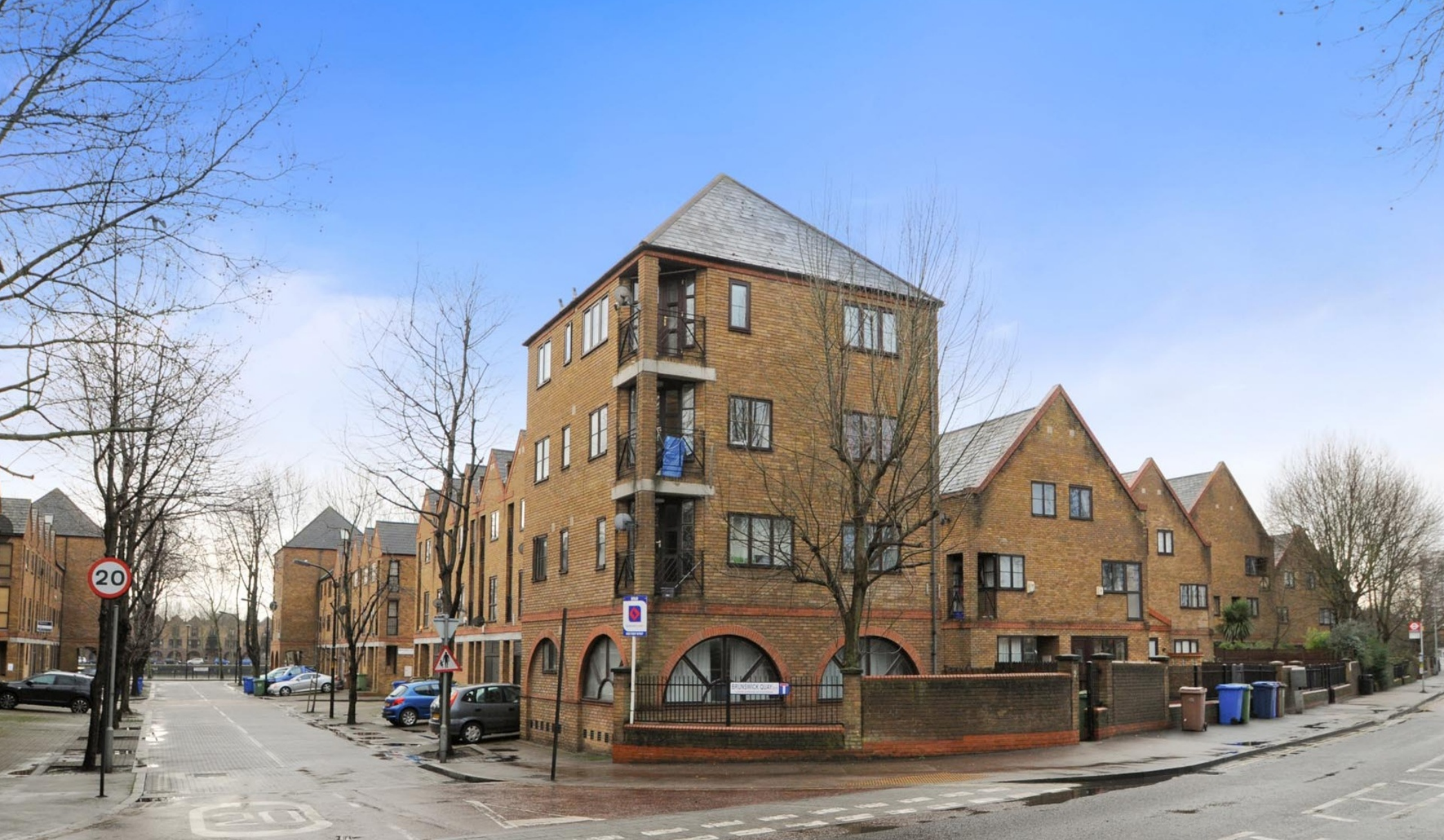
BRUNSWICK QUAY SE16 2 bedroom apartment