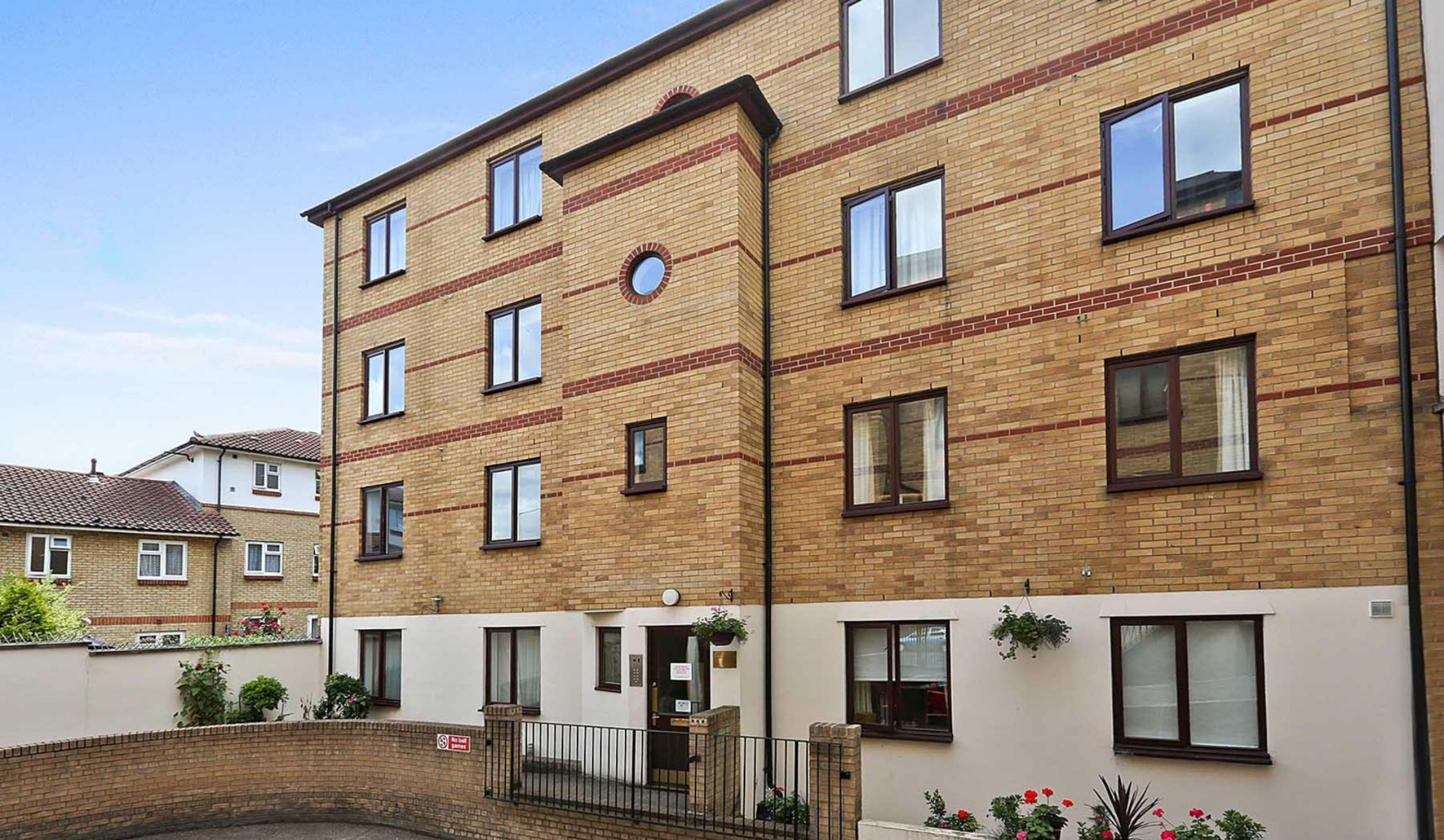
TIDEWAY COURT SE16 2 bedroom apartment