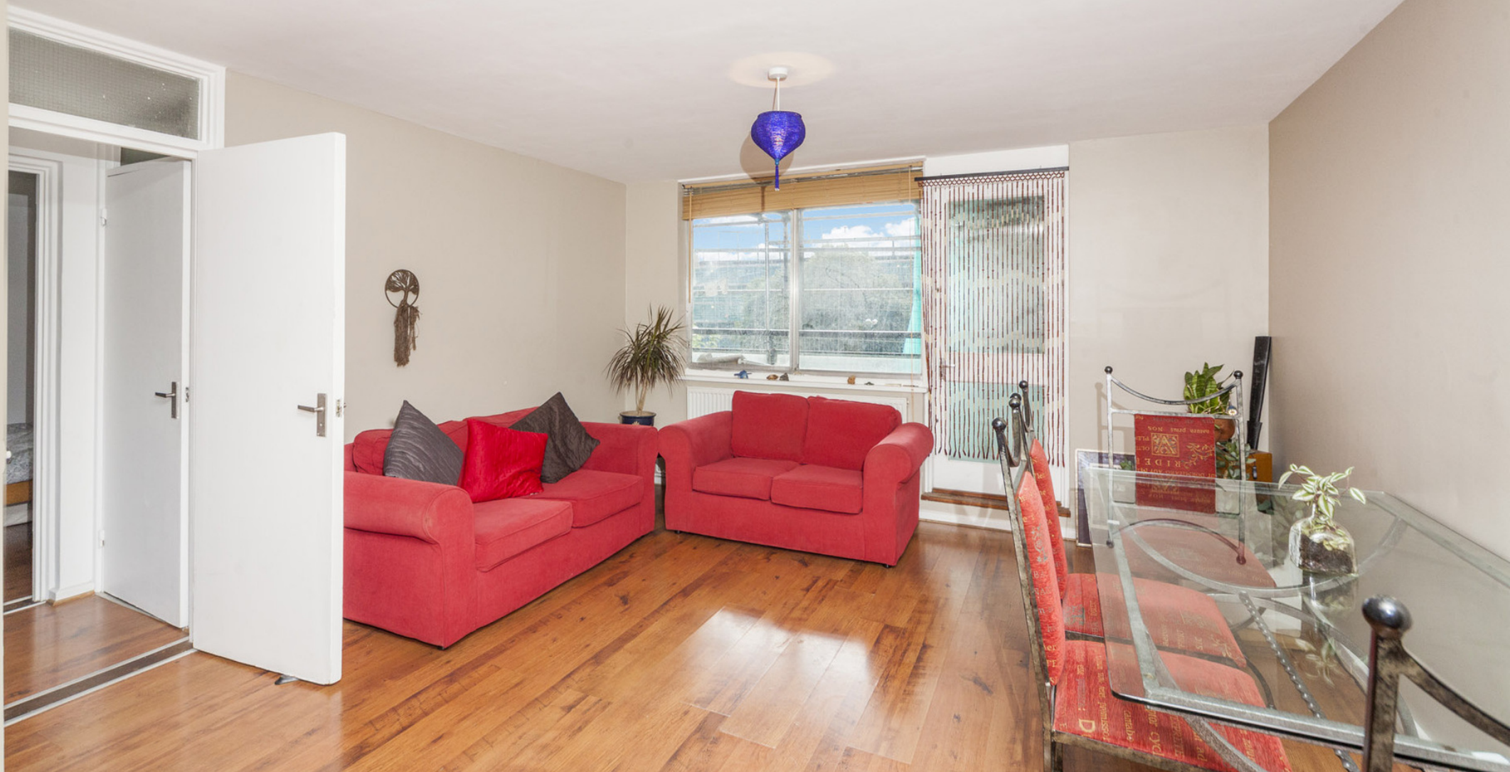
MARDEN SQUARE SE16 1 bedroom apartment