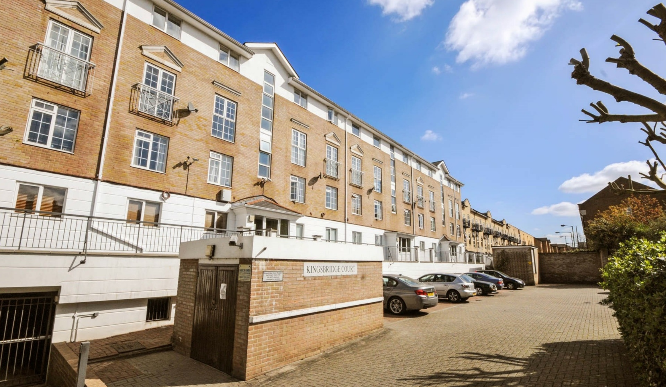
KINGSBRIDGE COURT E14 1 bedroom apartment