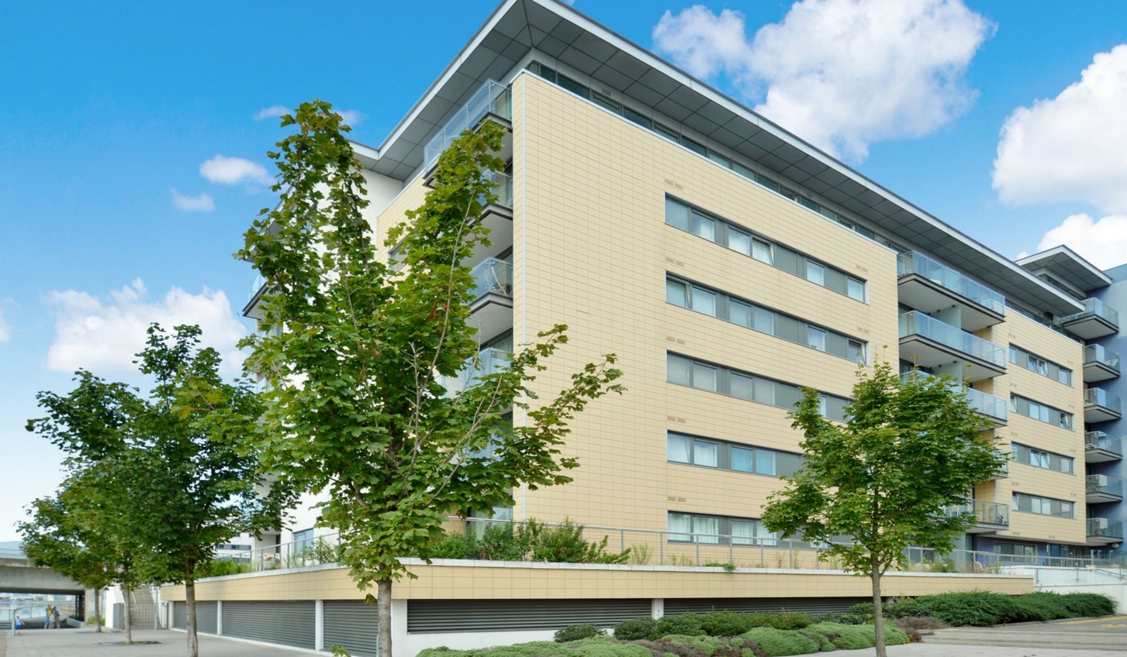
FATHOM COURT E16 2 bedroom apartment