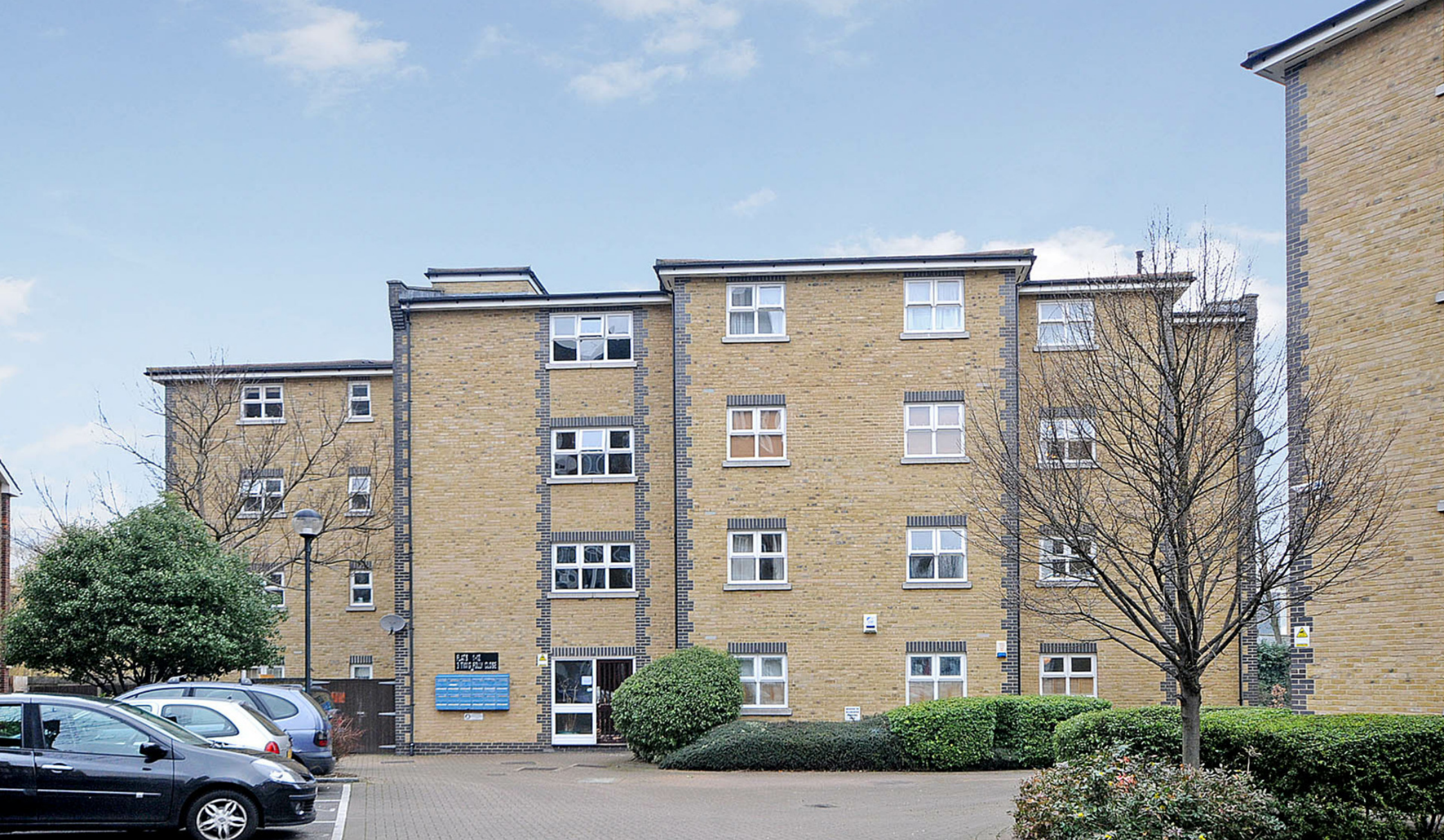
TWIG FOLLY CLOSE E2 1 bedroom apartment