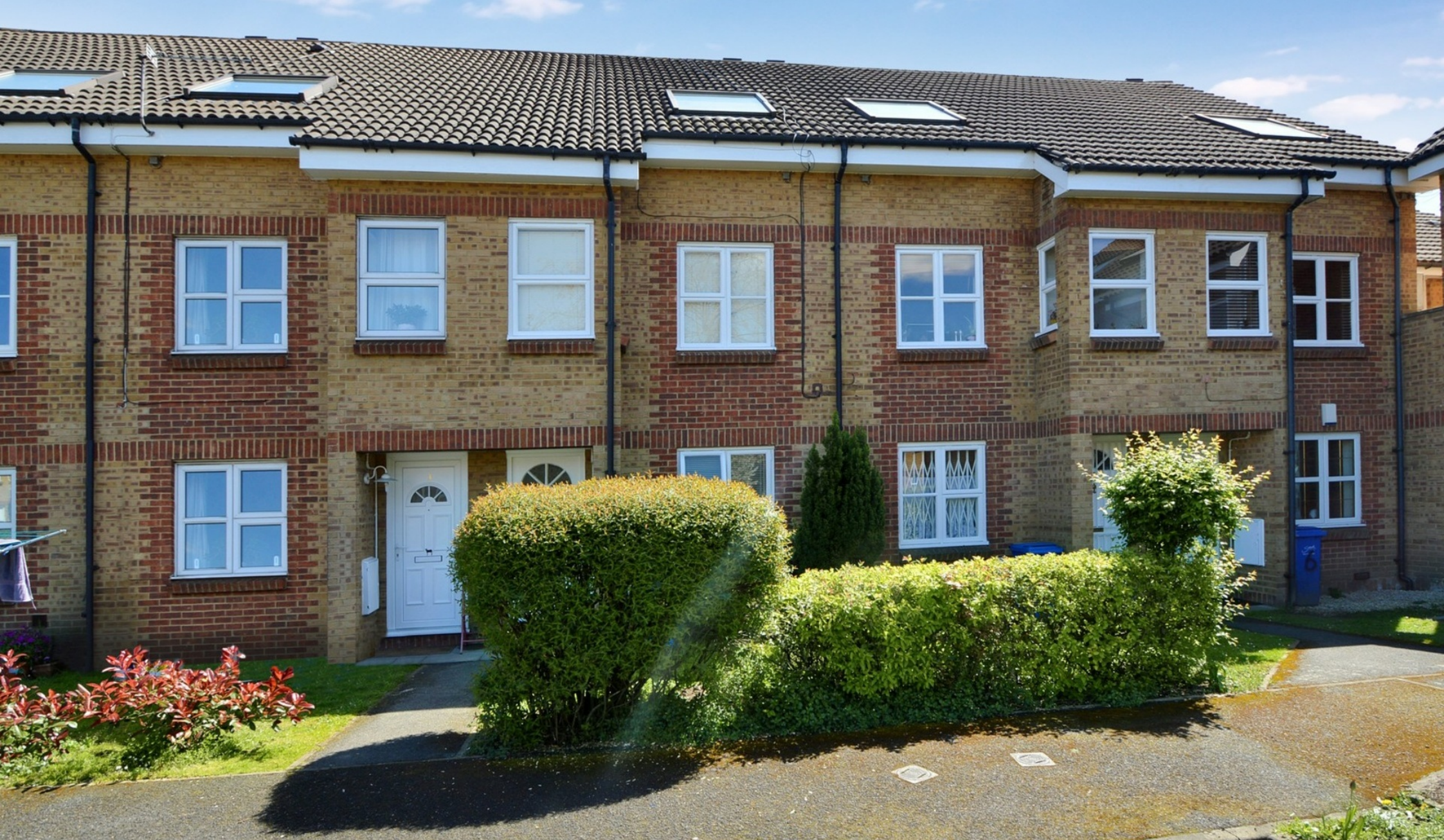
ABINGDON CLOSE SE1 1 bedroom apartment