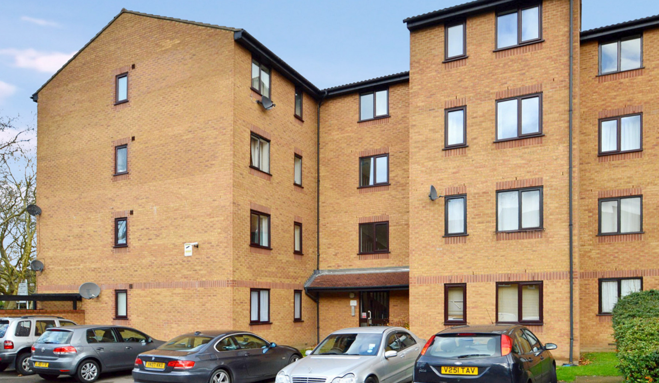
INWEN COURT SE8 1 bedroom apartment