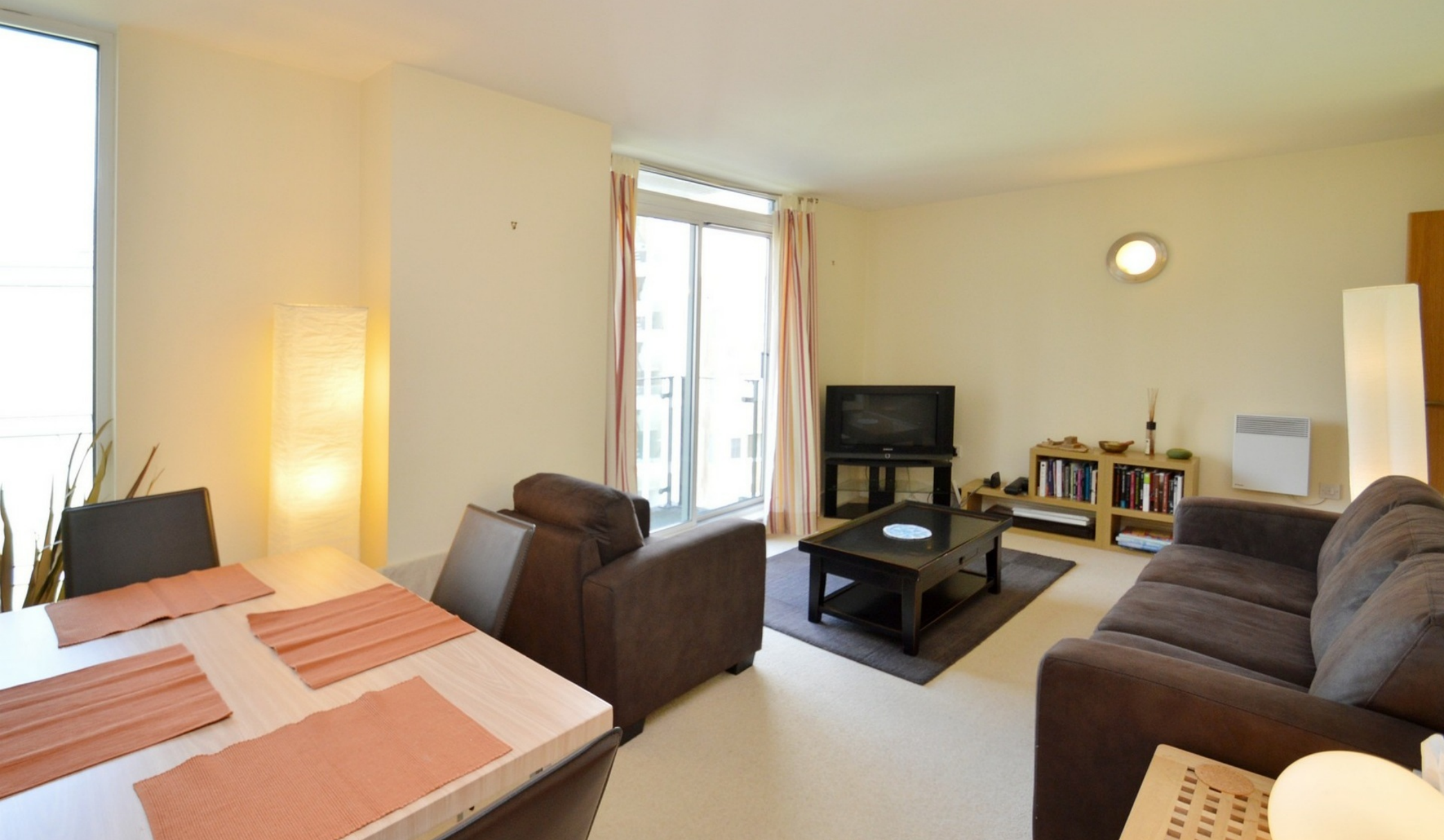
DOCKLANDS COURT E14 1 bedroom apartment