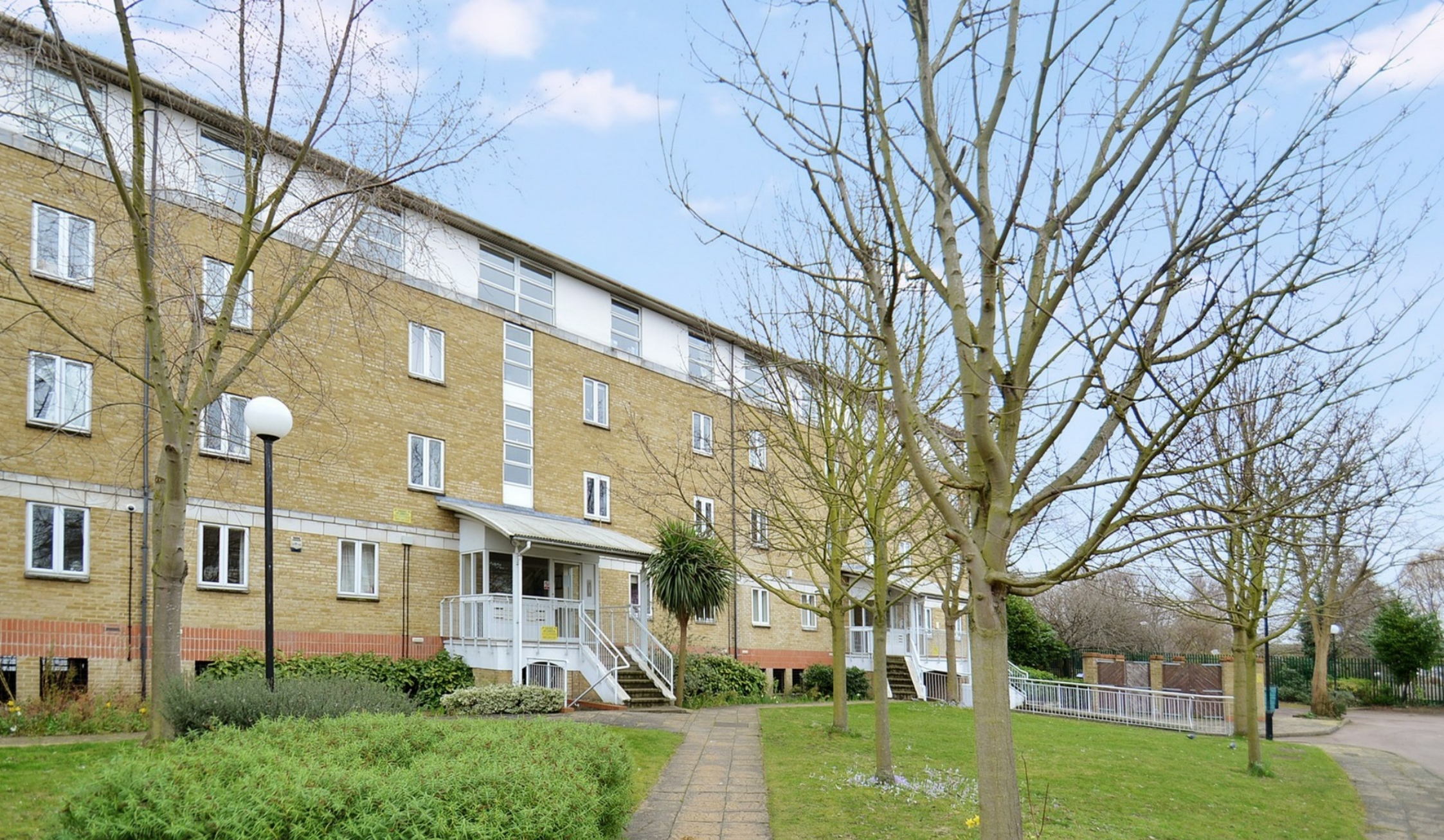
BUCHANAN COURT SE16 1 bedroom apartment