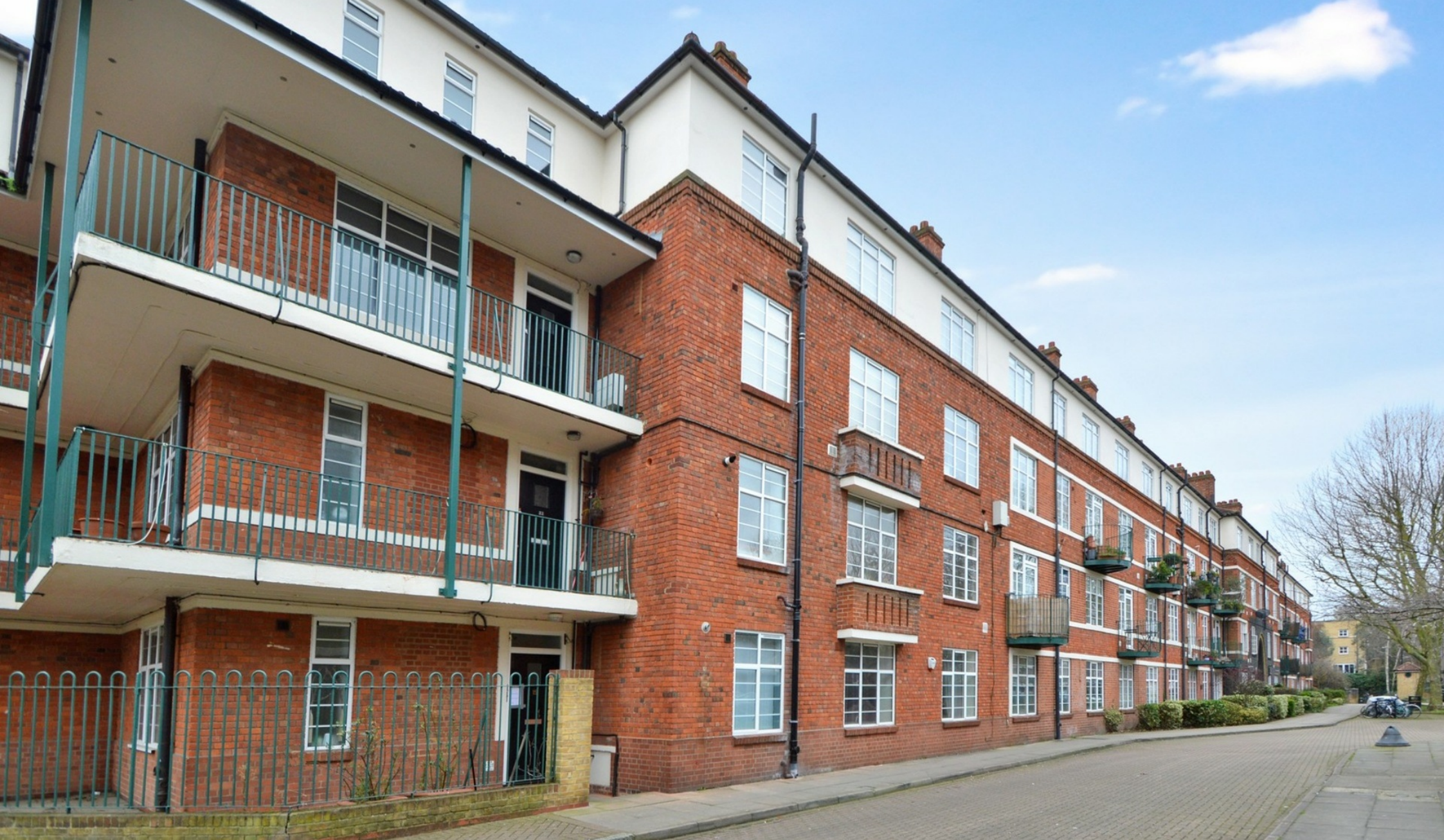
WALKER HOUSE SE16 1 bedroom apartment