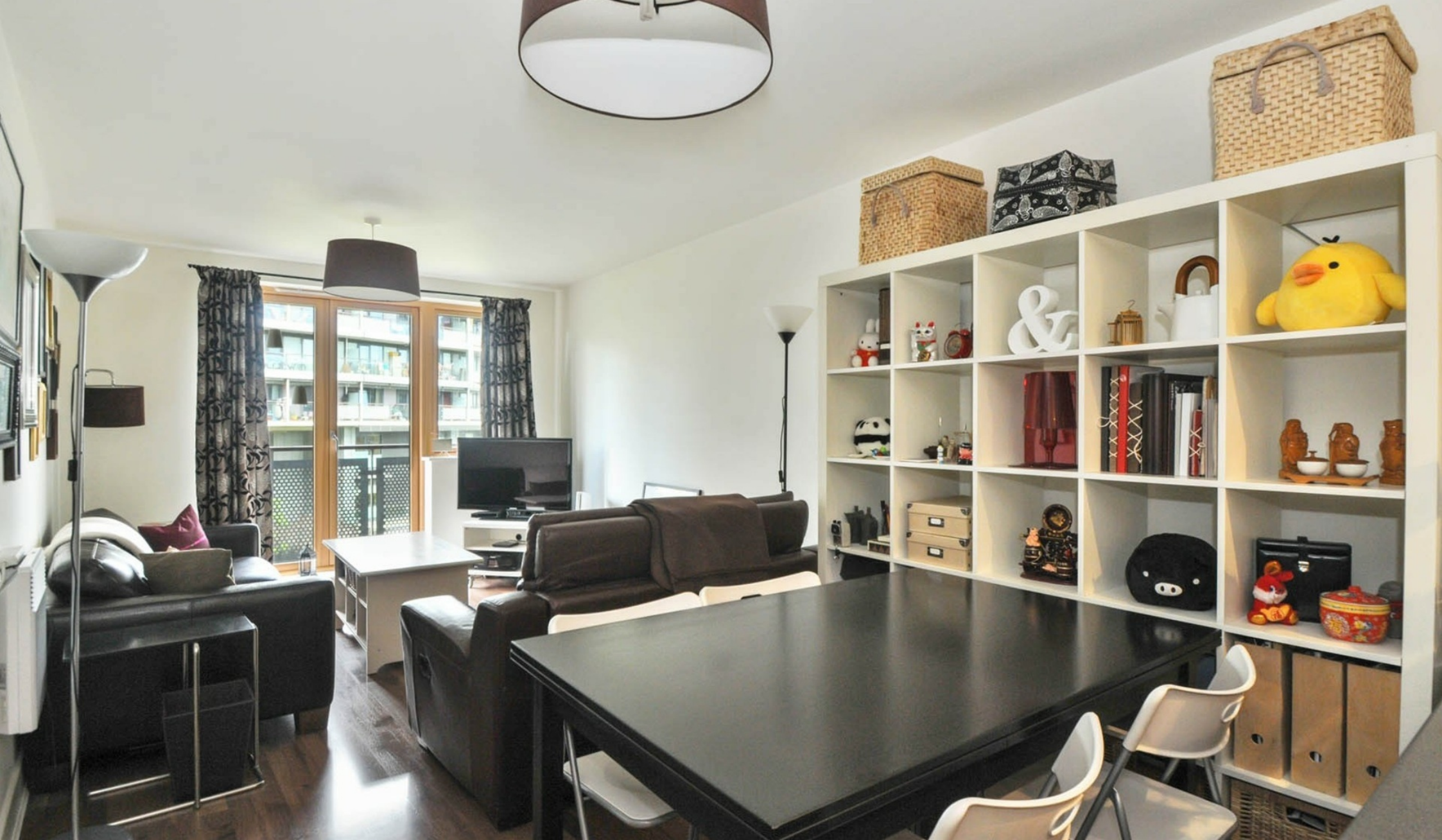
LEAMORE COURT E2 2 bedroom apartment