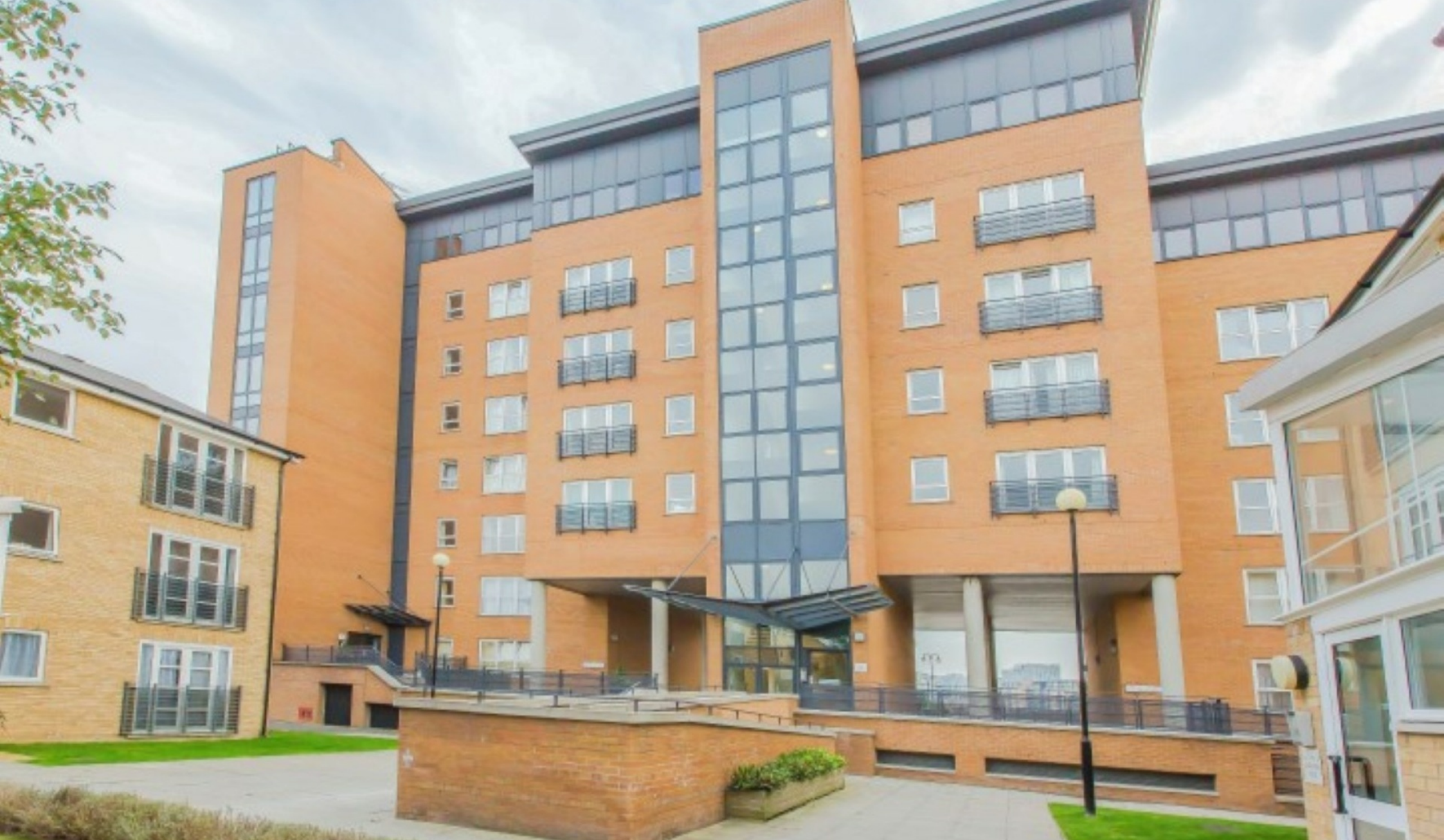
LANGBOURNE PLACE E14 2 bedroom apartment