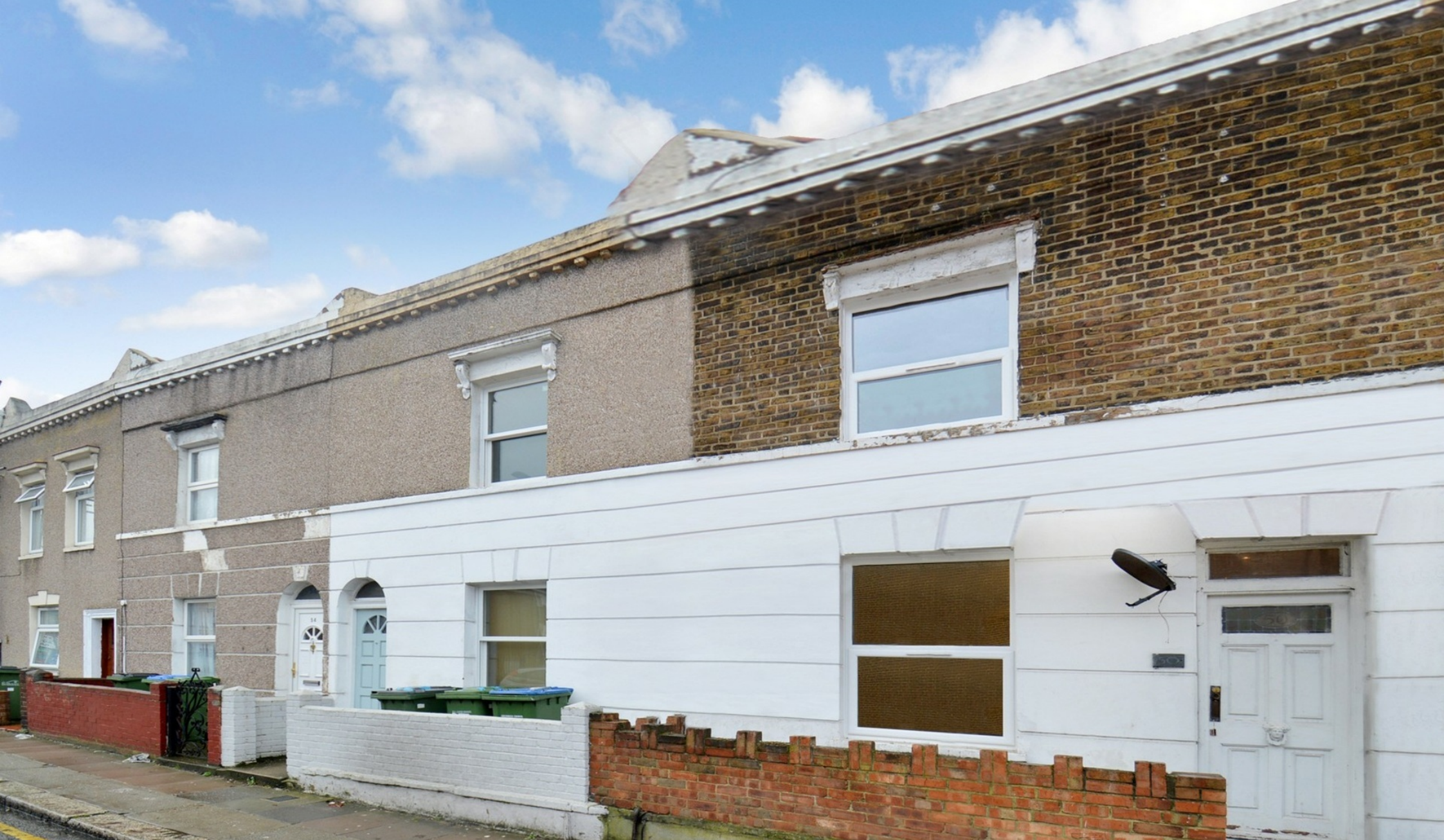
SANDY HILL ROAD SE18 4 bedroom terraced house