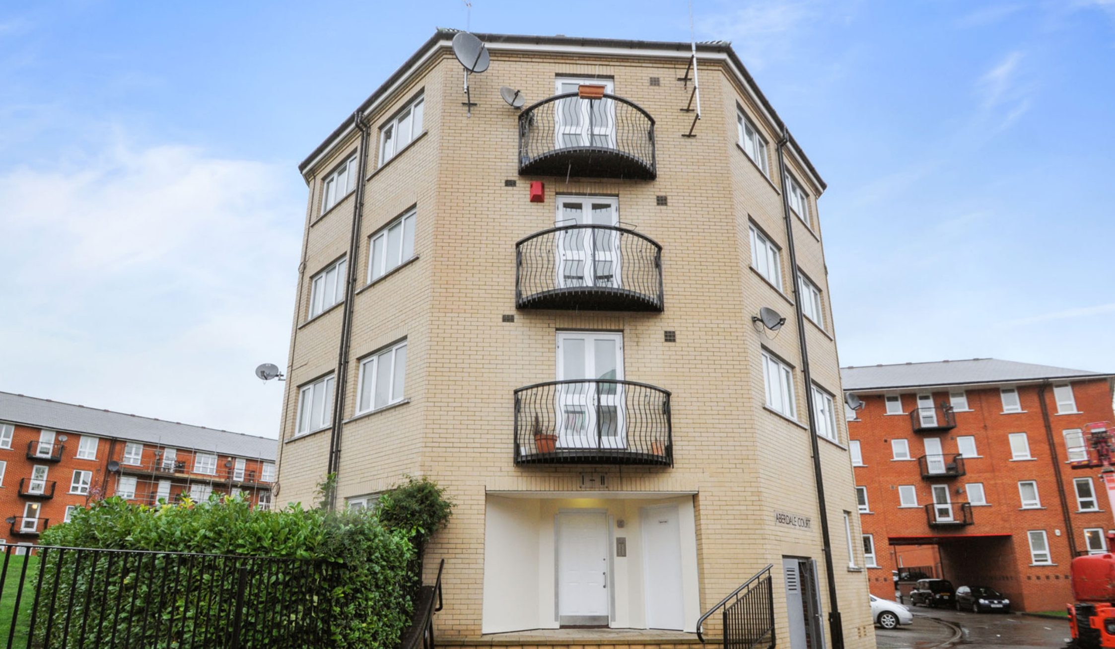
ABERDALE COURT SE16 1 bedroom apartment