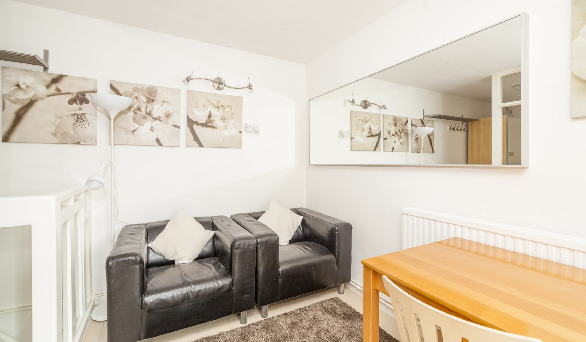
ARDENT HOUSE E3 2 bedroom apartment