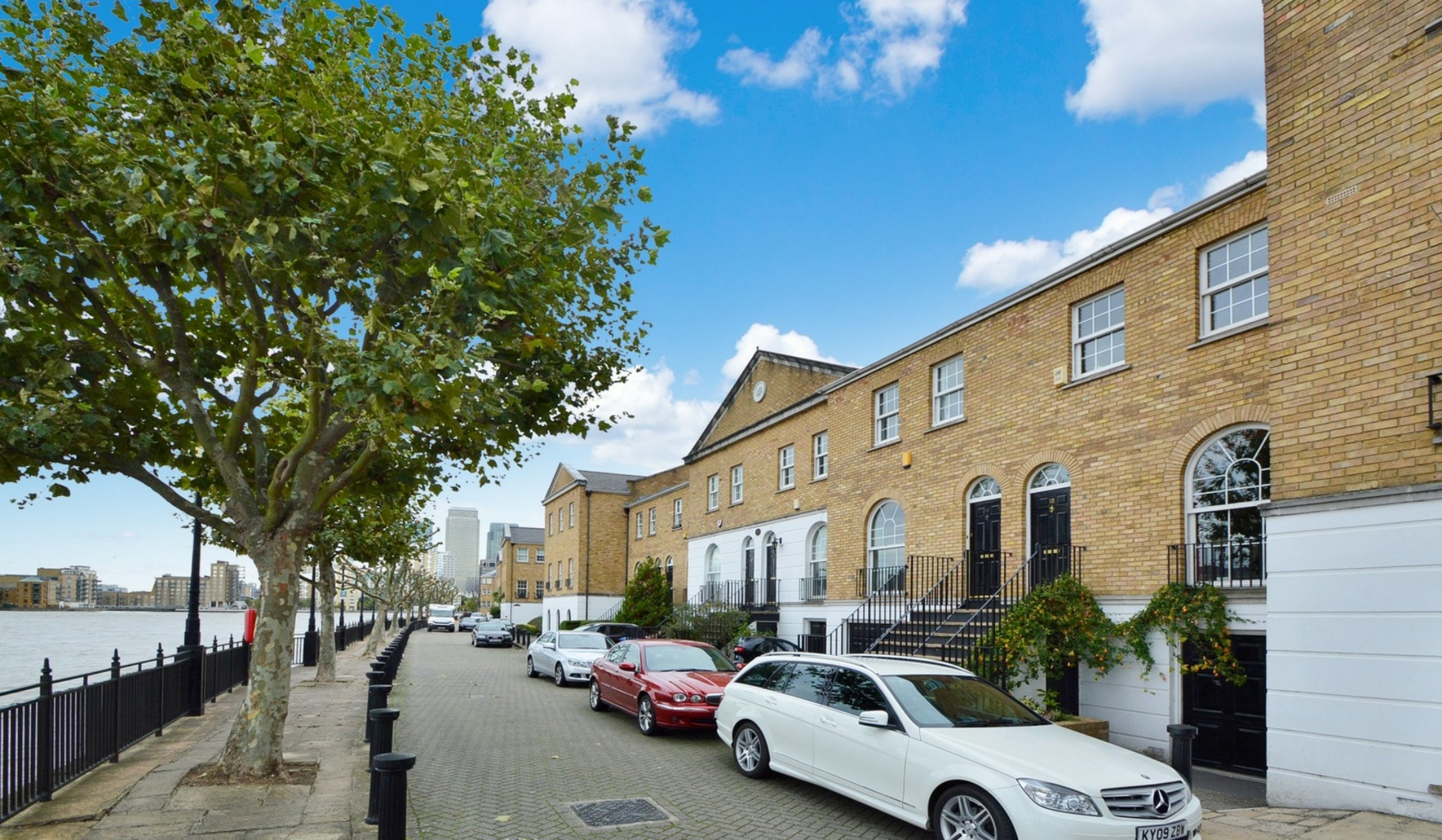
ELIZABETH SQUARE SE16 1 bedroom apartment