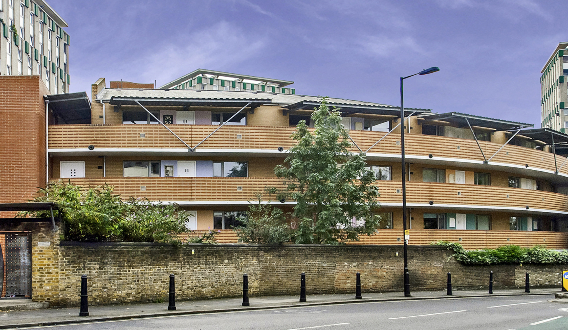
BRIDGE WHARF E2 2 bedroom apartment