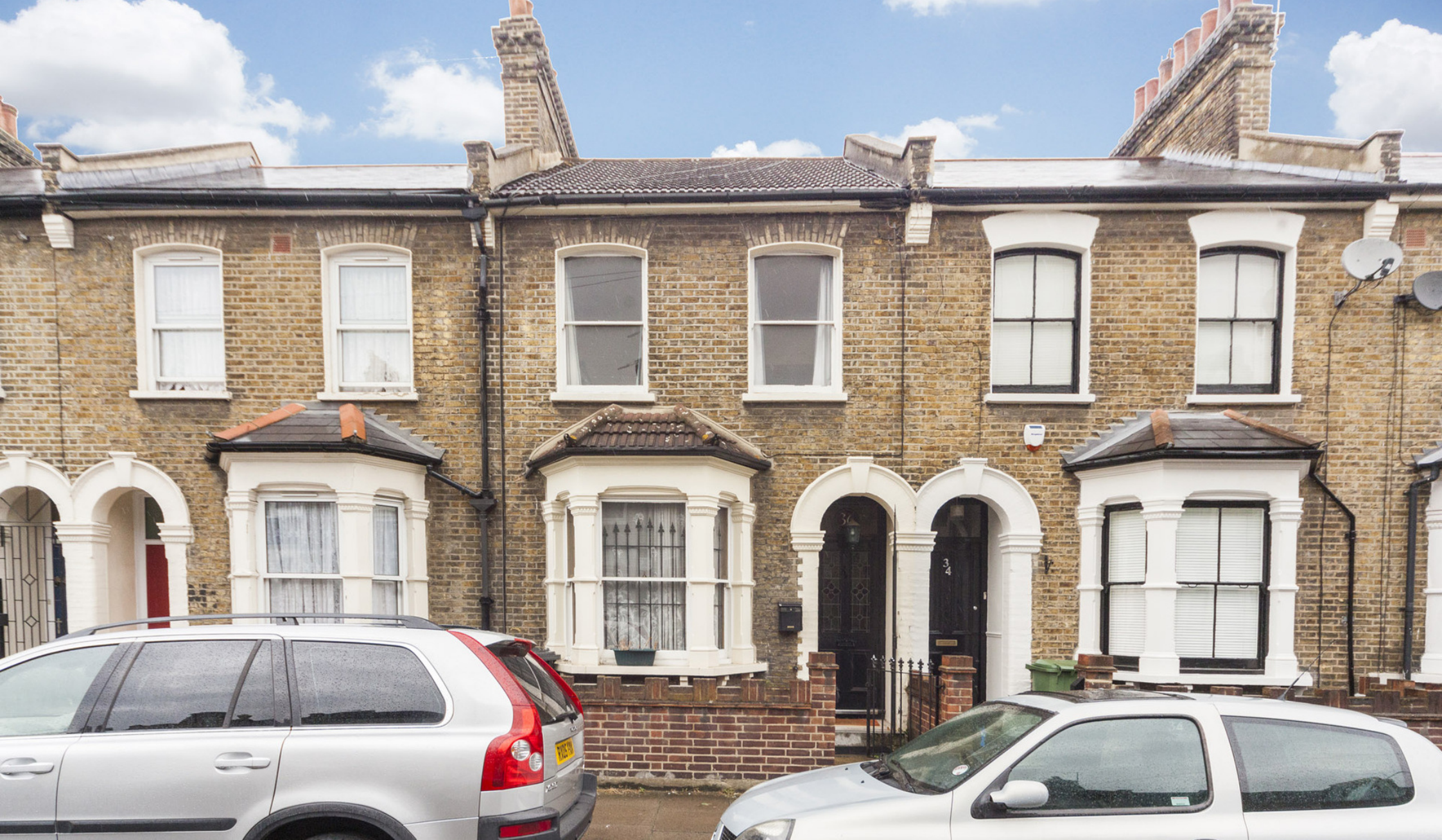
ALLOA ROAD SE8 3 bedroom terraced house