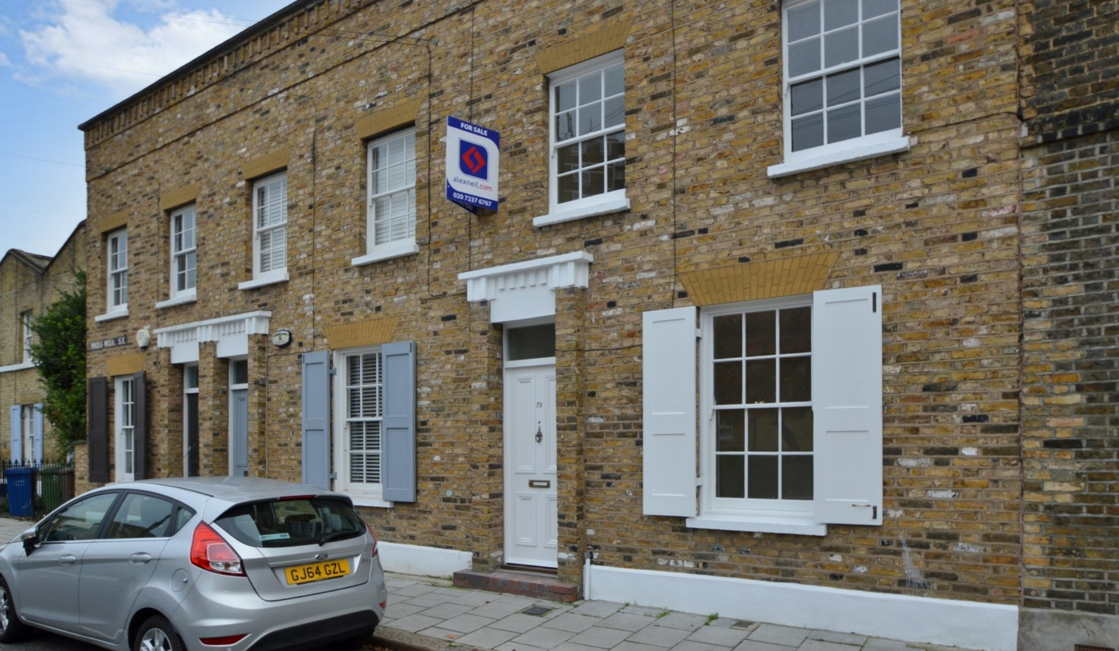
PAGES WALK SE1 4 bedroom terraced house