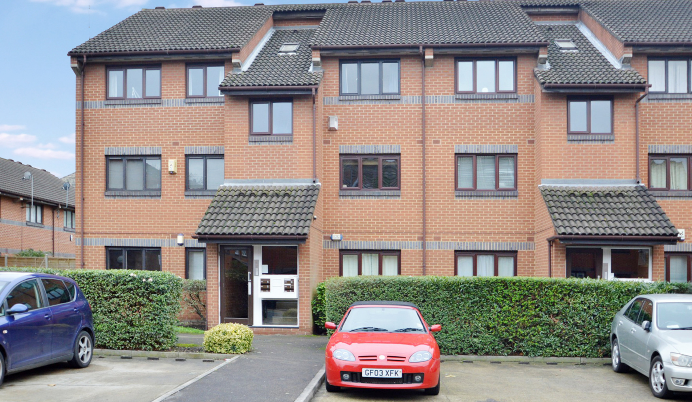
BRYMAY CLOSE E3 1 bedroom apartment