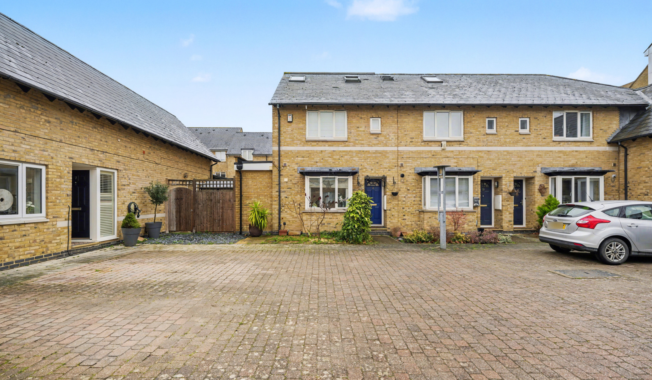
DA GAMA PLACE E14 3 bedroom terraced house