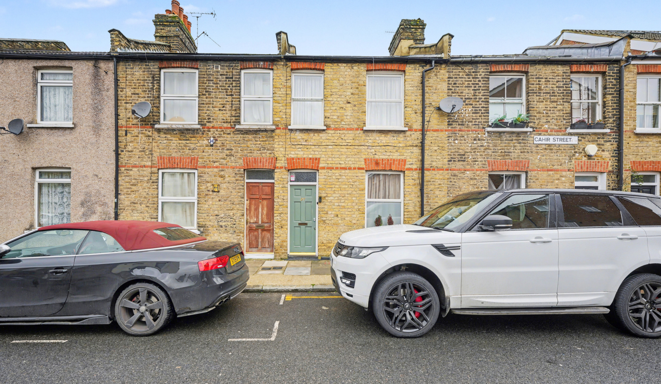
CAHIR STREET E14 2 bedroom terraced house