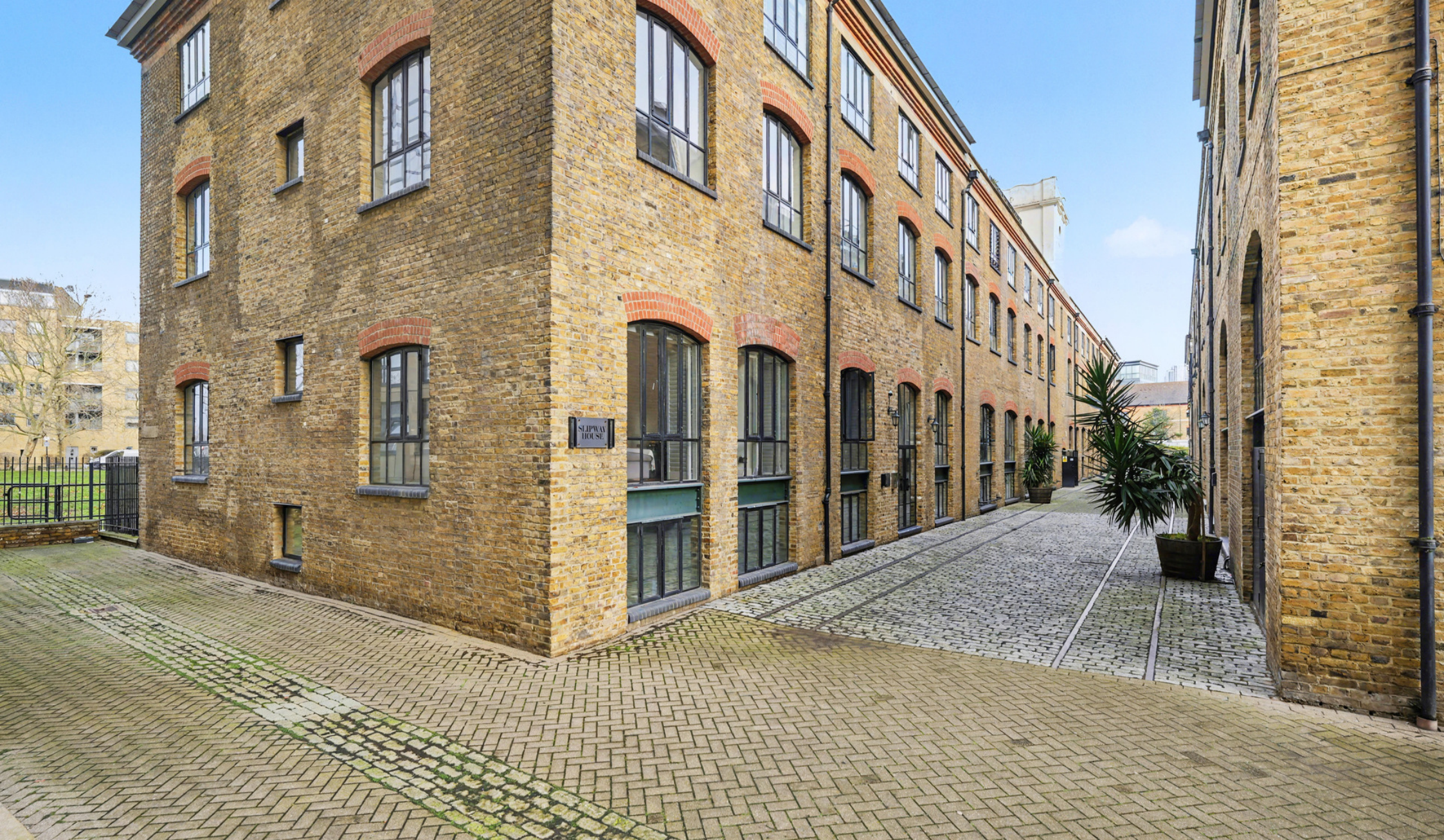
SLIPWAY HOUSE E14 1 bedroom apartment