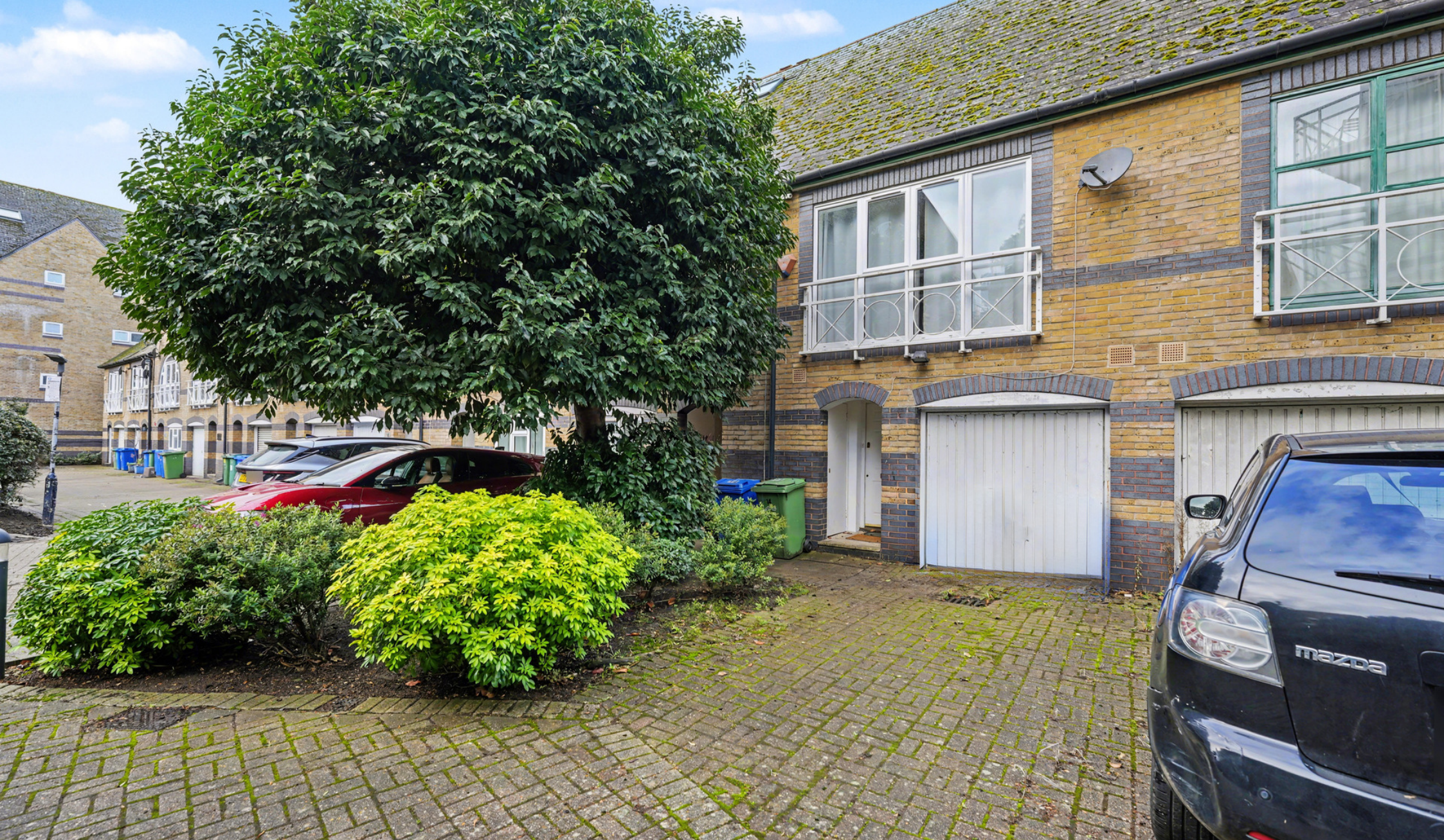
ELEANOR CLOSE SE16 3 bedroom terraced house