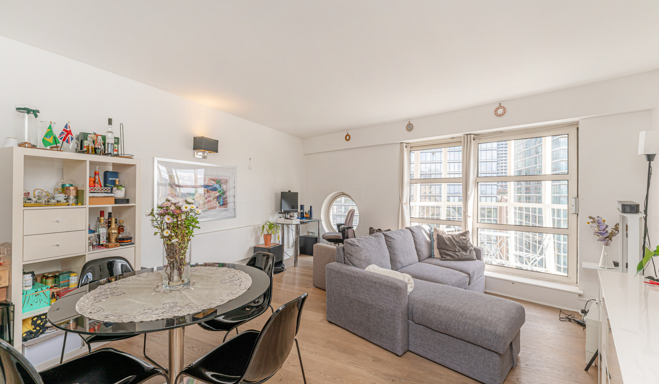
CASCADES TOWER E14 2 bedroom apartment