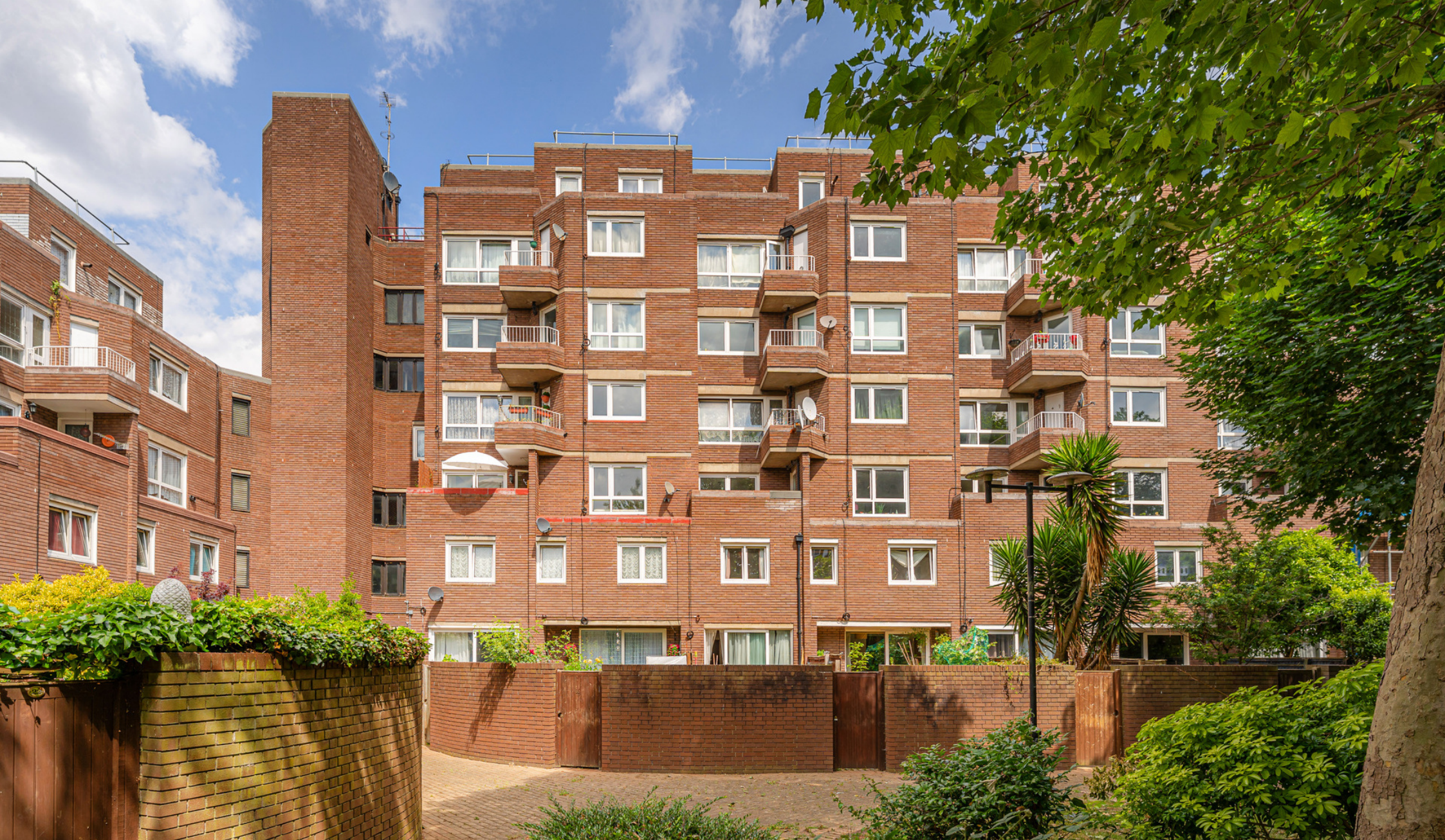
KILN COURT E14 2 bedroom apartment