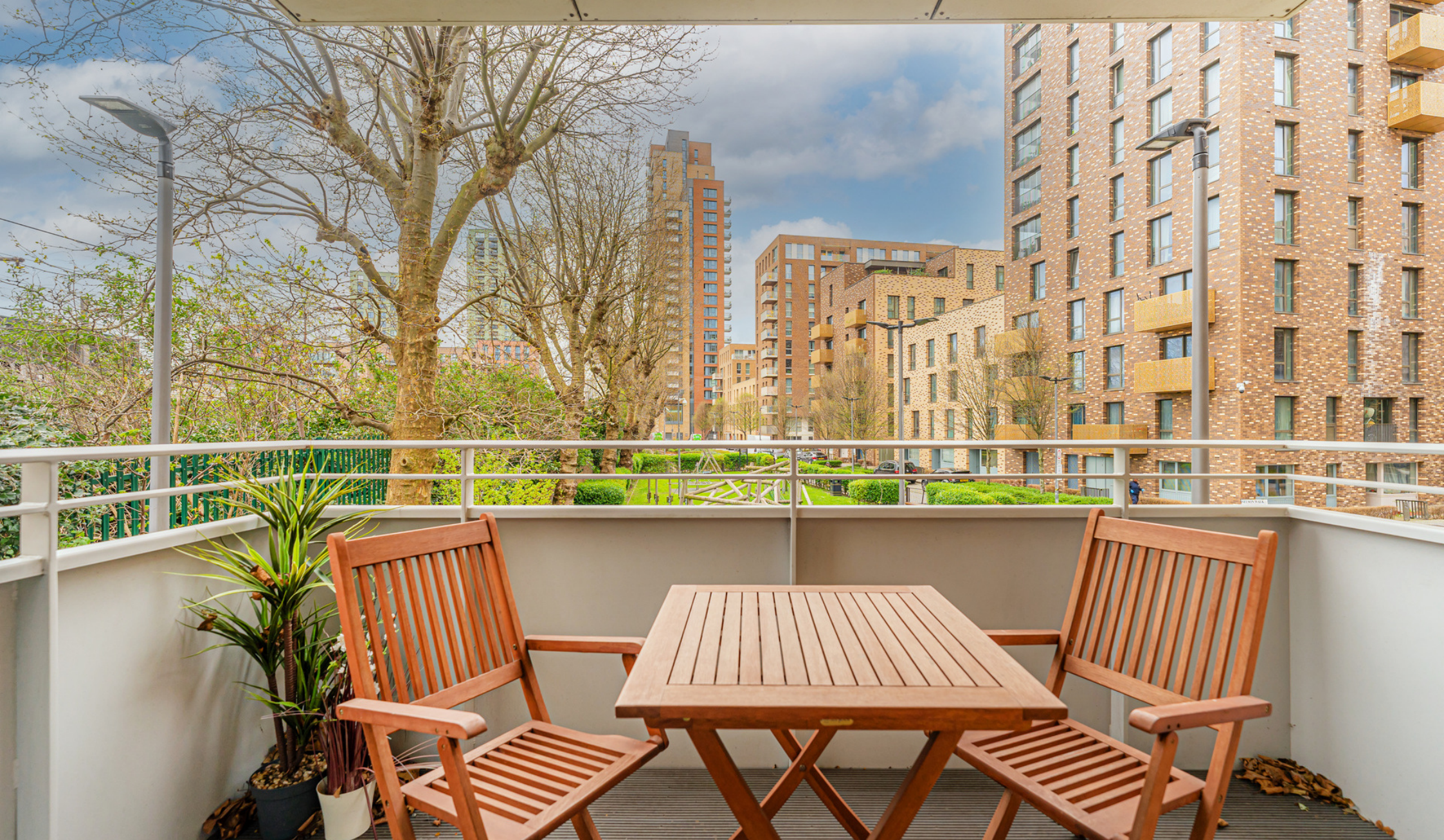
IVY POINT E3 2 bedroom apartment