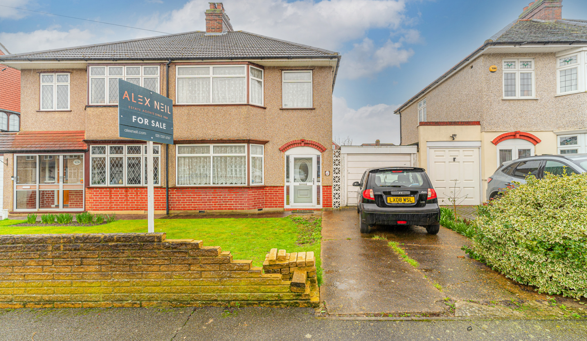
SANDRINGHAM DRIVE DA16 3 bedroom semi-detached house