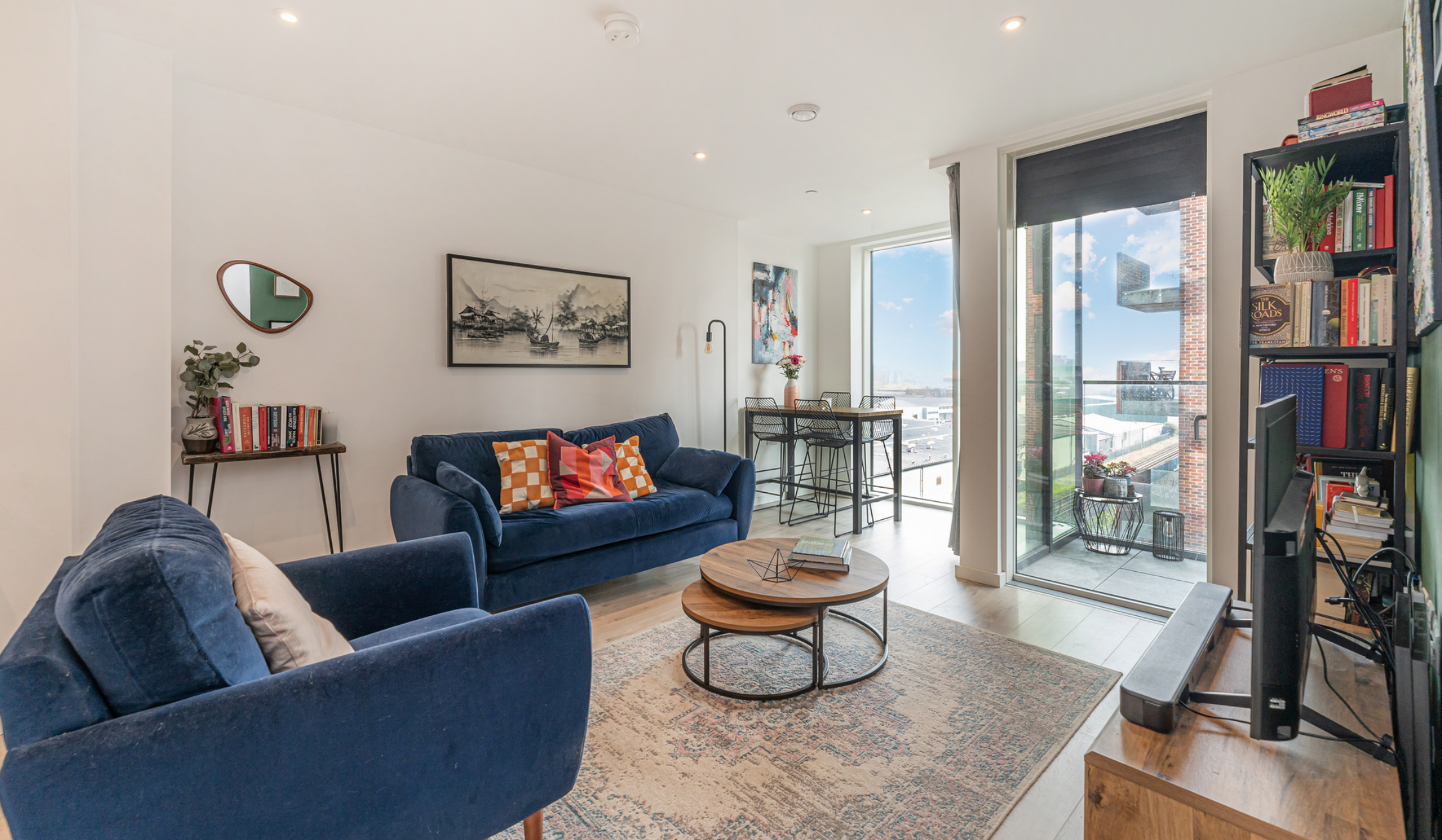
KITSON HOUSE E3 1 bedroom apartment