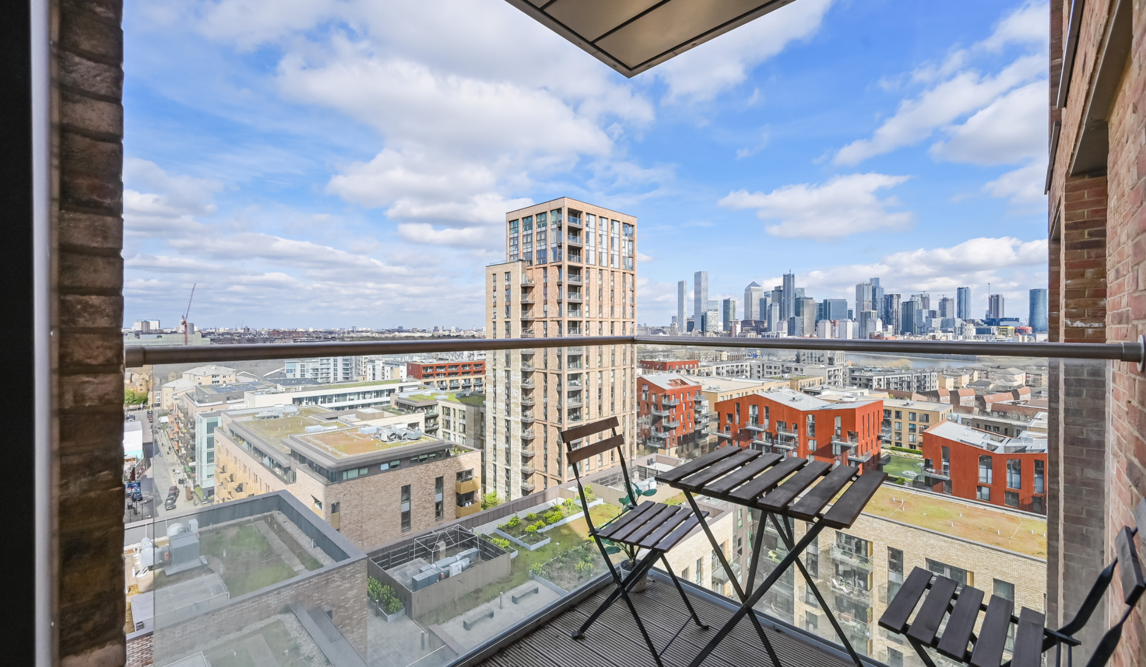
MALMO TOWER SE8 1 bedroom apartment