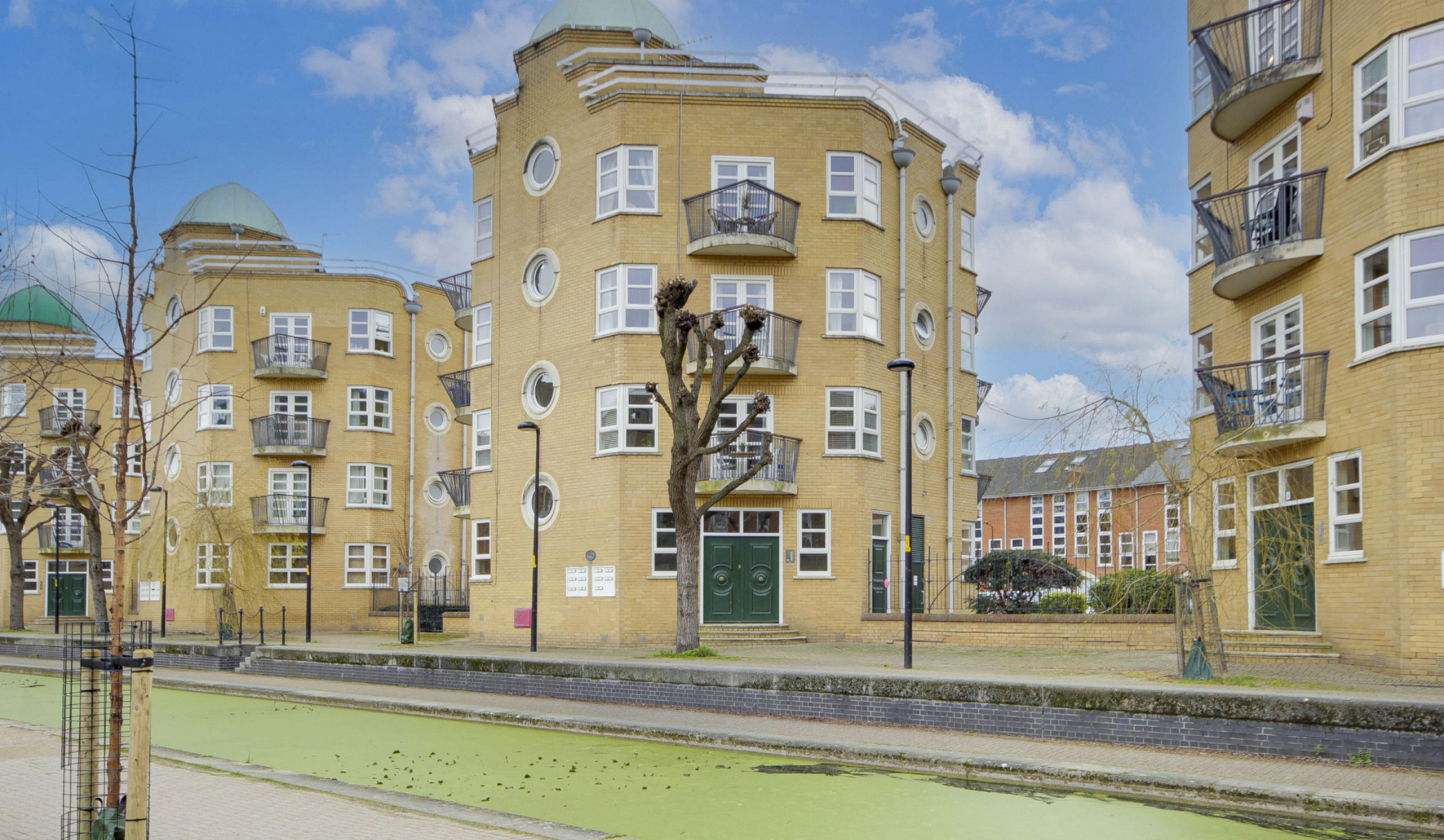
JAMES HOUSE SE16 1 bedroom apartment