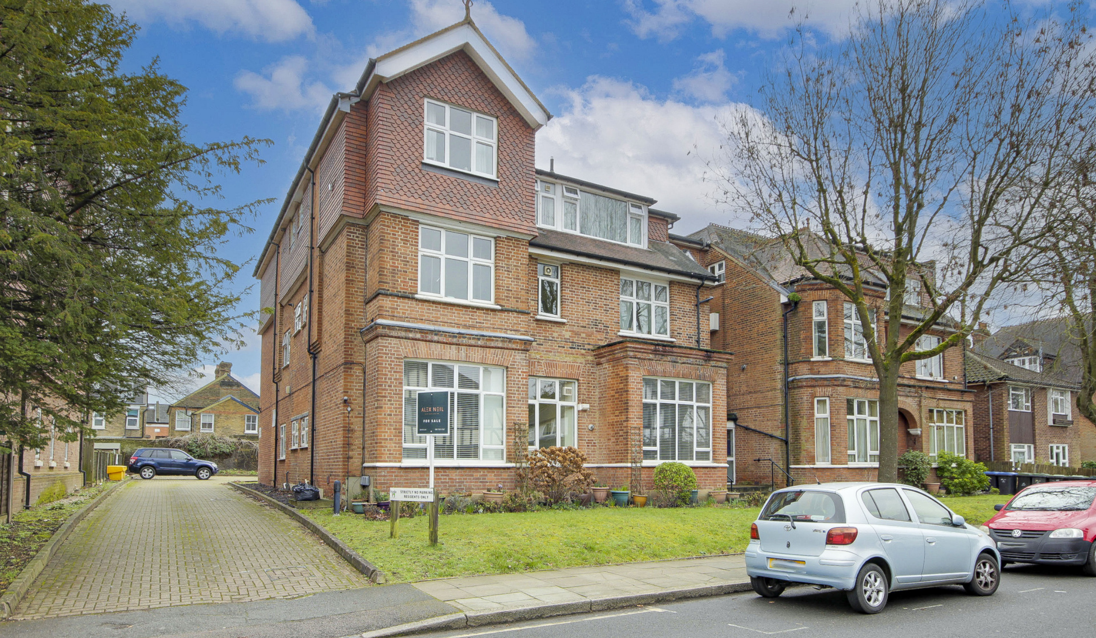
ELIZABETH COURT BR1 1 bedroom apartment