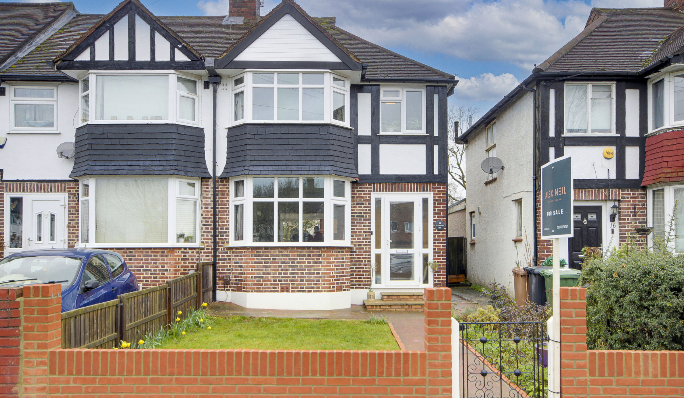
JEVINGTON WAY SE12 3 bedroom end of terrace